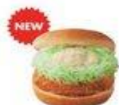
Shrimp Cutlet Burger