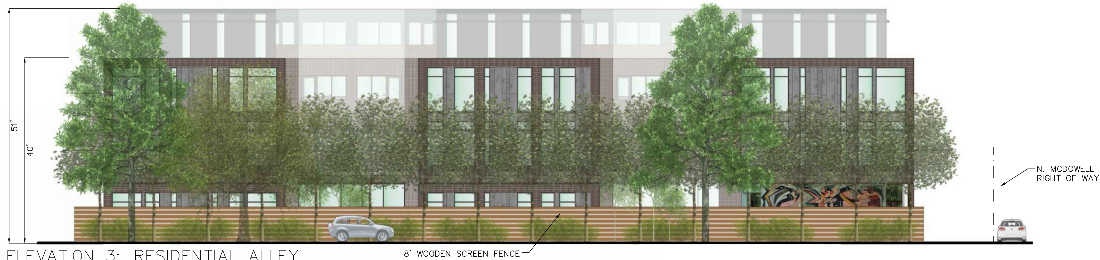
ELEVATION 3: RESIDENTIAL ALLEY