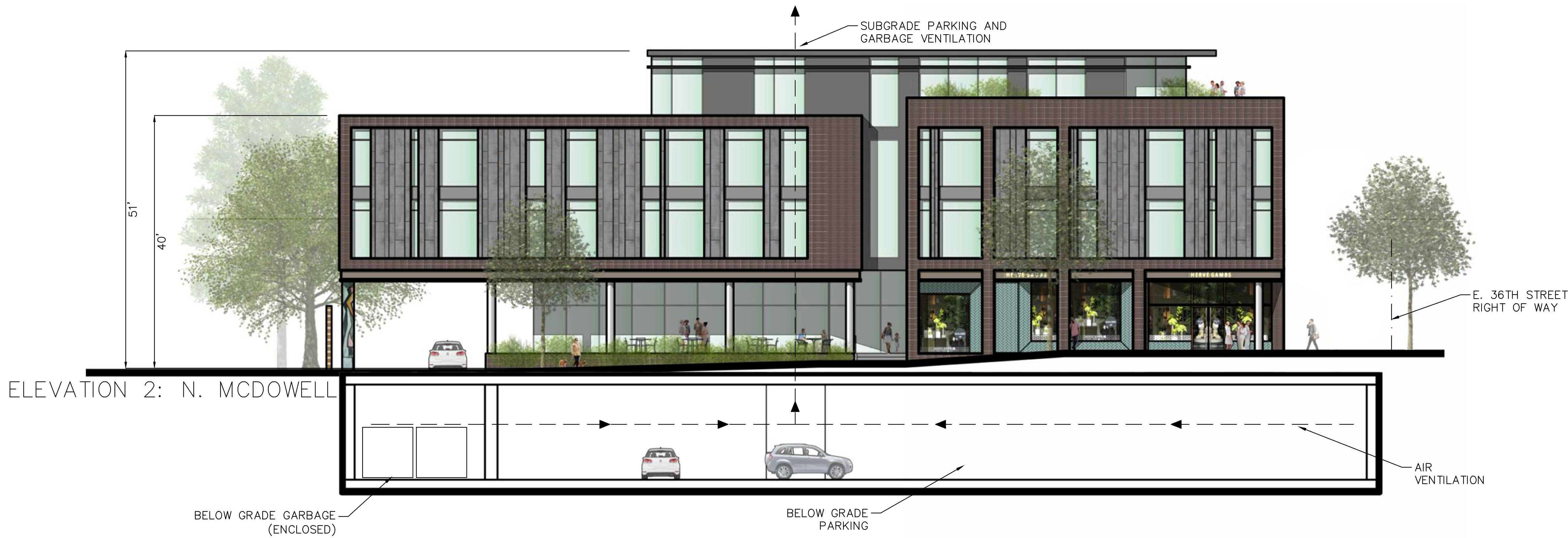
ELEVATION 2: N. MCDOWELL