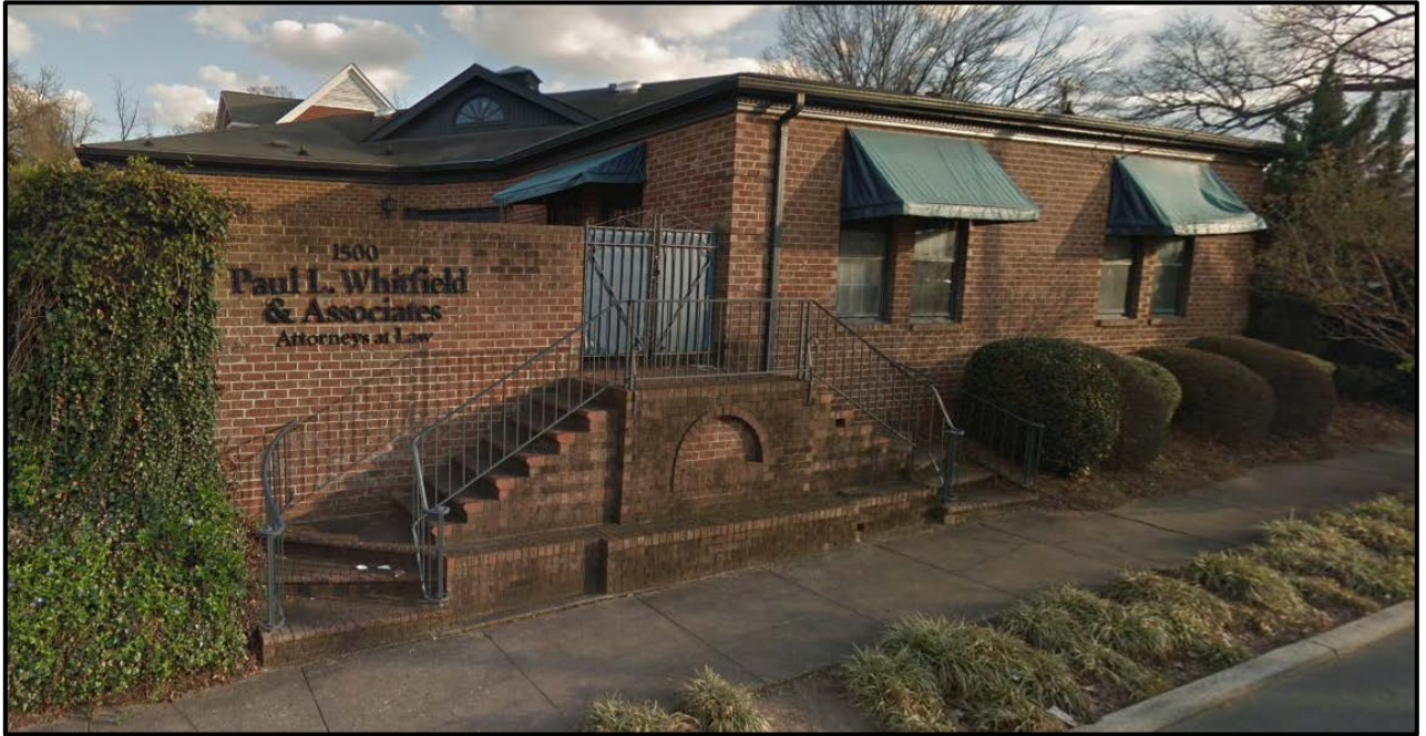
The property across South Torrence Street is developed with an office use.