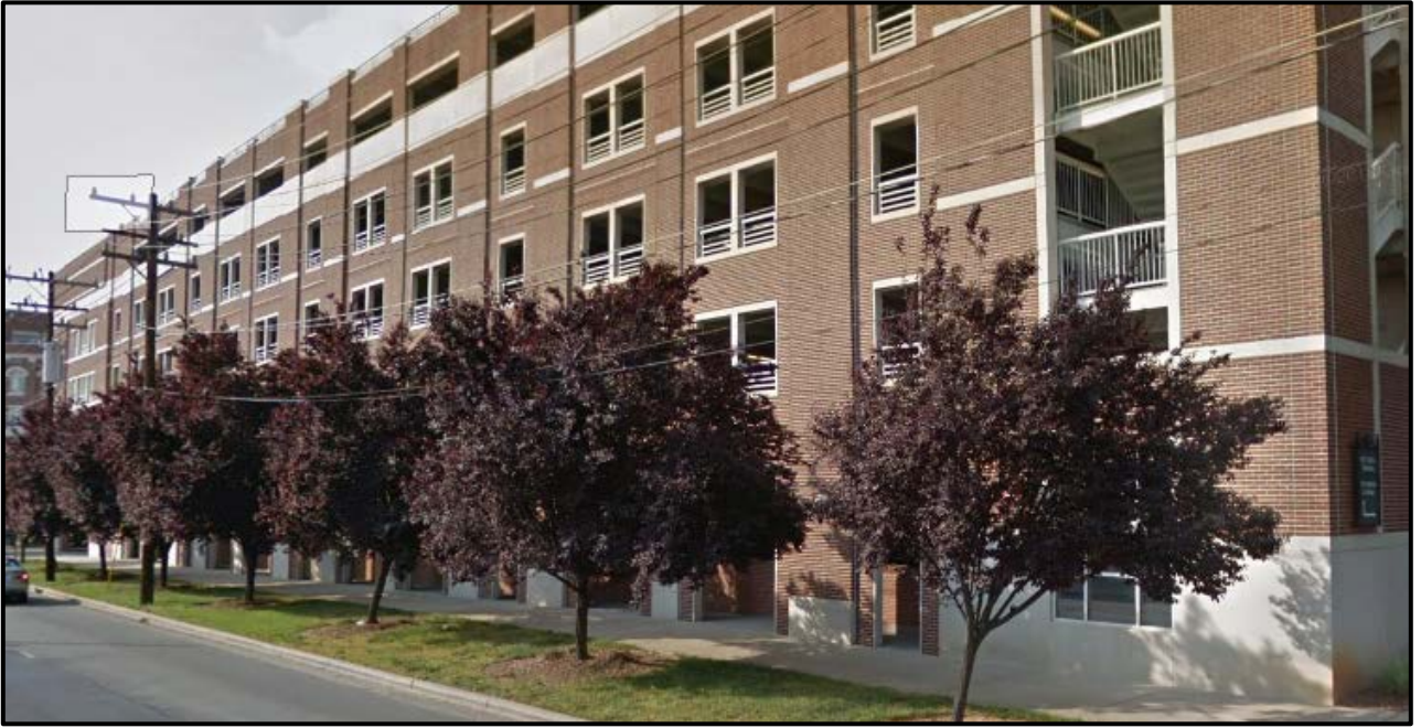
The property to the north along East 4 th Street is the CPCC parking deck.