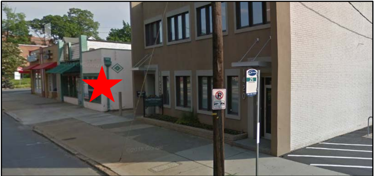
The adjacent property along East 4 th Street is developed with an office use. The red star indicates the subject property.