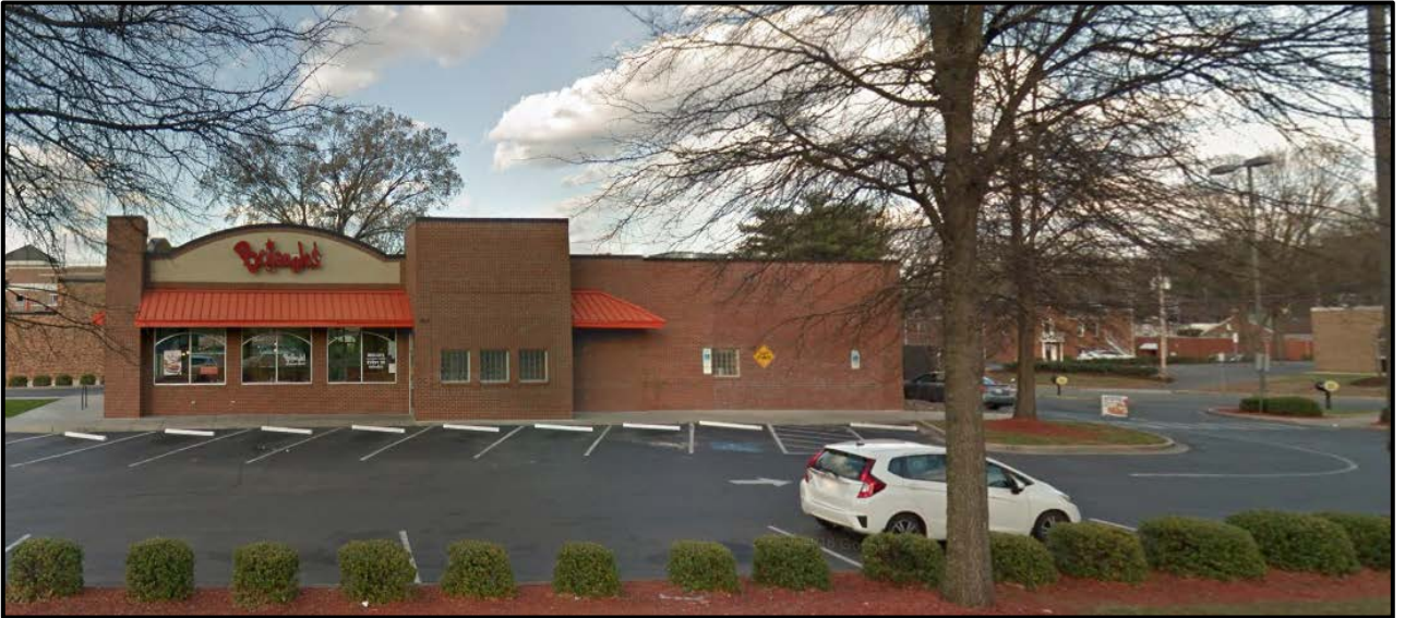
The property to the west along 3 rd Street is developed with a Bojangles restaurant.