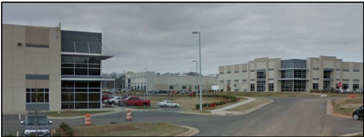
Property to the west along Entrance Drive is developed with warehouse/distribution uses.