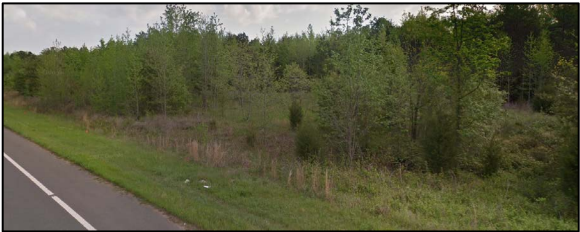
Property to the east along Sandy Porter Road is vacant.