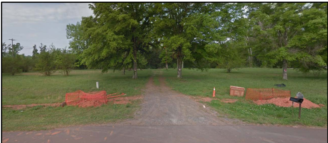
The subject property is vacant.