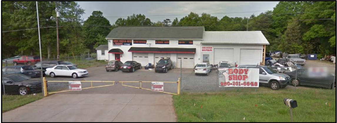
A portion of the property along Sandy Porter Road was developed with an automotive body shop, which has been demolished.