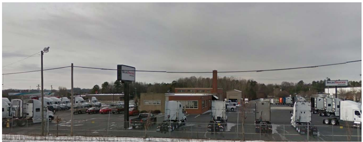
The subject property is developed with a truck sales/service garage use.

The site is currently developed with an auto sales/service garage/warehouse and is immediately surrounded by a mix of office/warehouse uses and retail uses.