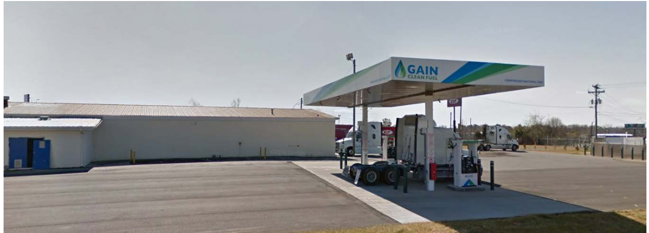
The property to the south is developed with a truck refueling station.