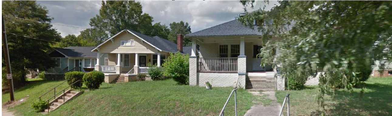
Properties to the east and west are developed with single family homes.