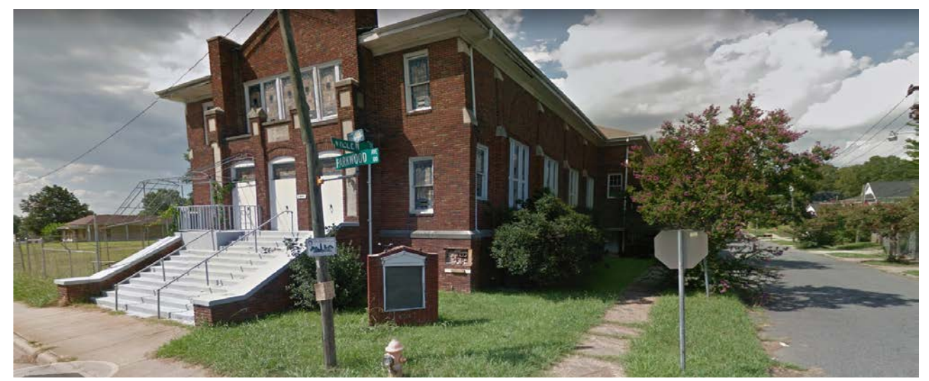
The subject property is zoned R-5 (single family residential) and developed with a former Church.