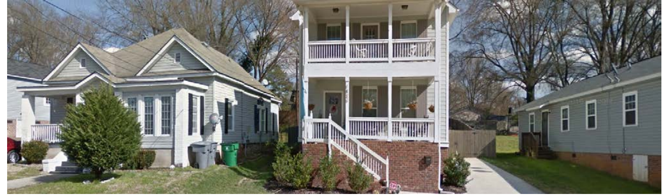
Properties to the north are developed with single family homes.