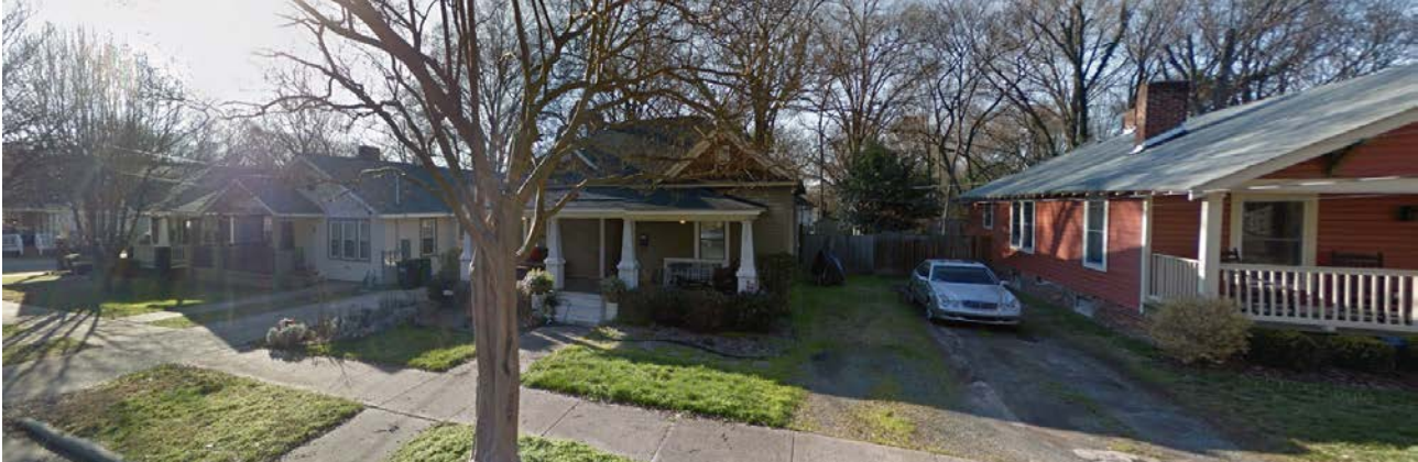
Properties to the south are developed with single family homes.