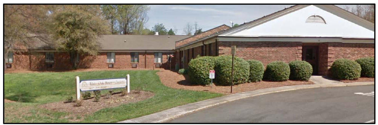
The property to the north is developed with senior living facilities along Craig Avenue.