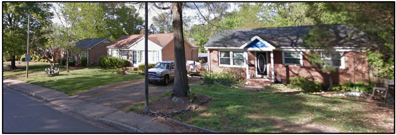
Property to the south is developed with single family homes along Craig Avenue.

Properties to the west are developed with apartments along Craig Avenue.