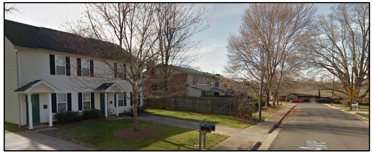
Properties to the east include attached homes and apartments along Delane Avenue.