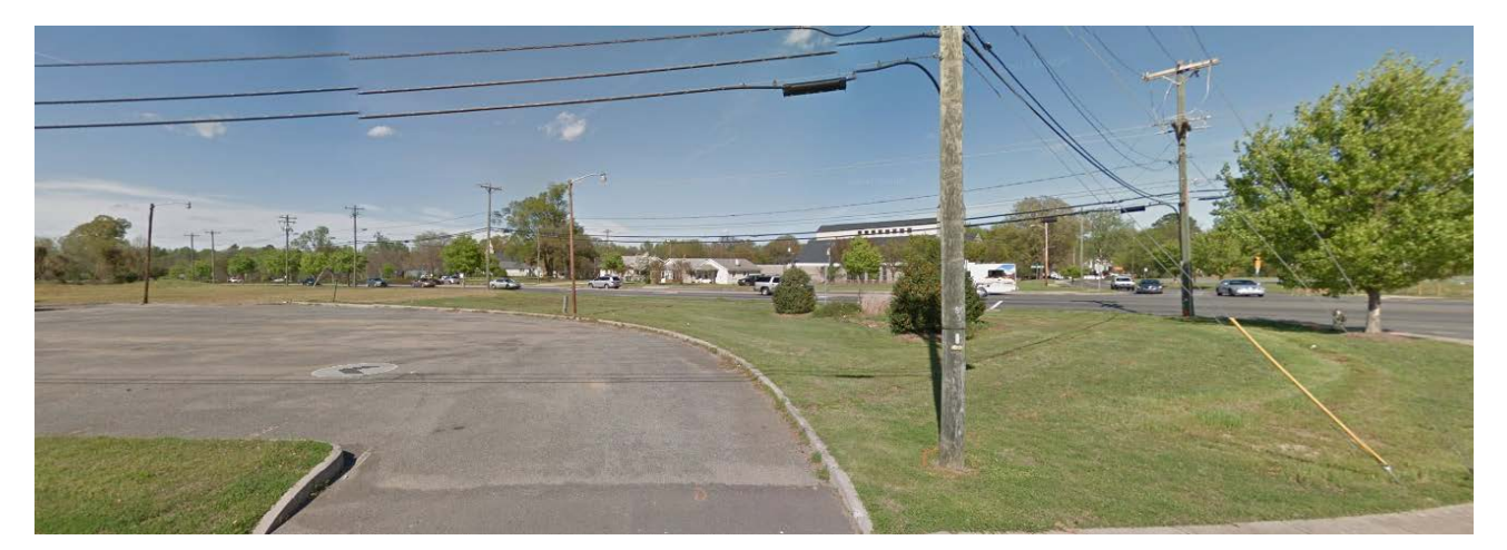
The subject site was formerly a Parks & Recreation outdoor pool and is currently vacant.