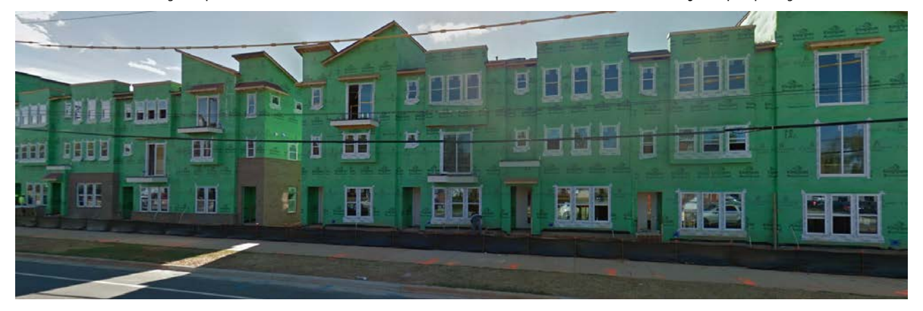
New apartments are under construction along Statesville Avenue to the south of the subject property.