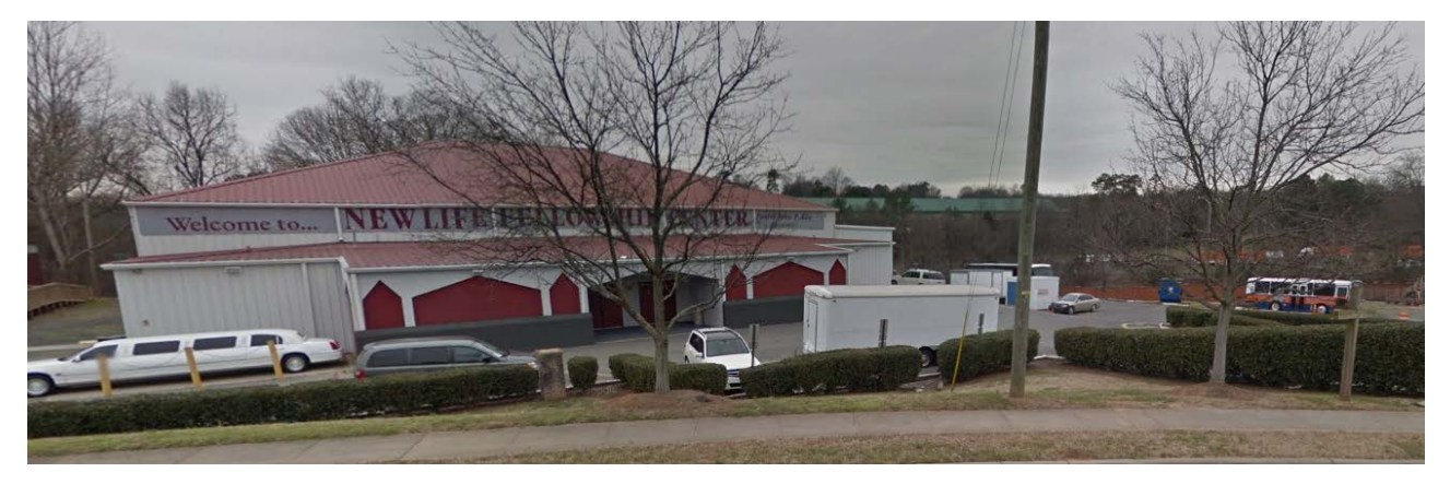
New Life Fellowship Church is located to the west of the property.