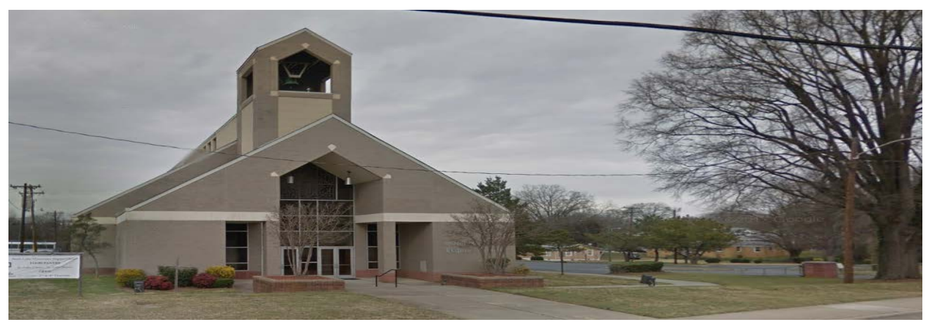
St. Luke Missionary Baptist Church is located across Statesville Avenue from subject property.