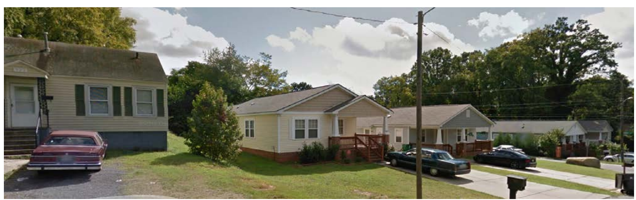
The Druid Hills Neighborhood is located to the east of the subject property.