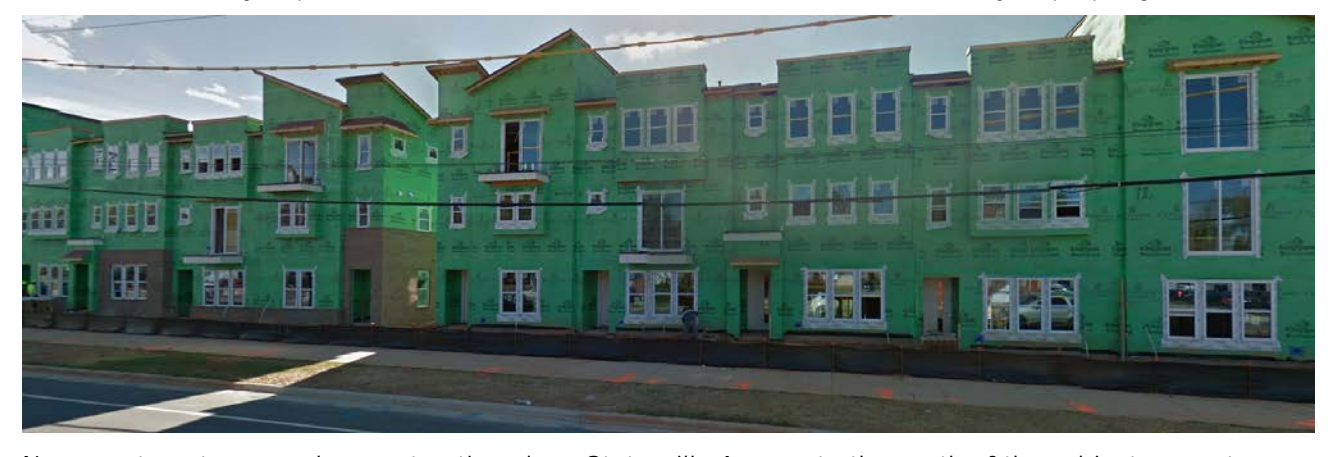
New apartments are under construction along Statesville Avenue to the south of the subject property.