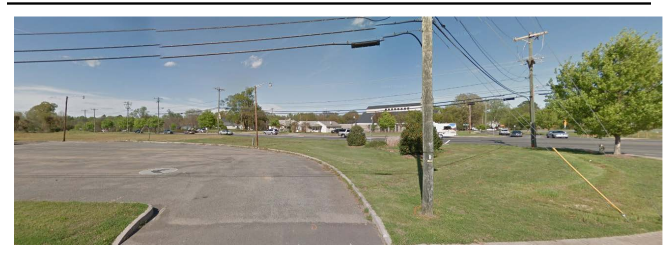
The subject site was formerly a Parks & Recreation outdoor pool and is currently vacant.