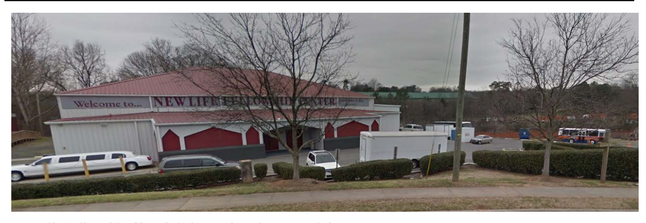
New Life Fellowship Church is located to the west of the property.