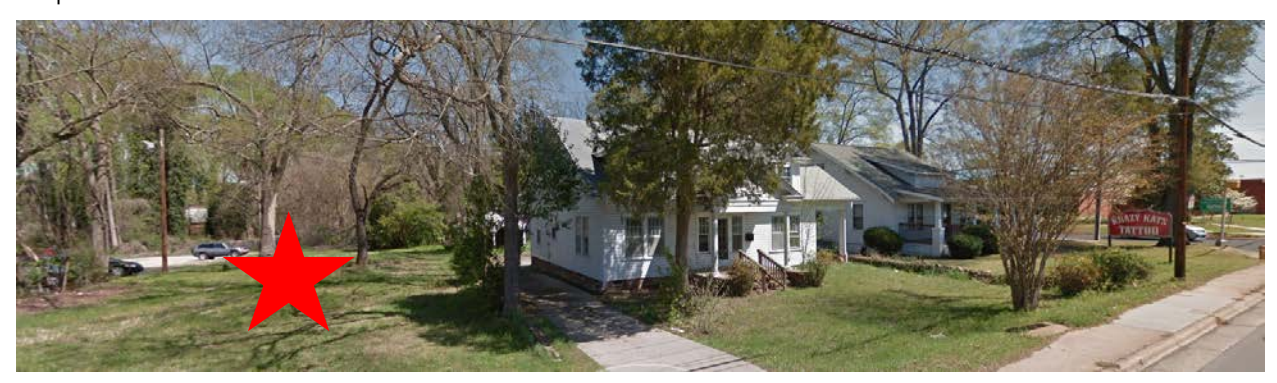
Oakhurst STEM Academy is located to the east.