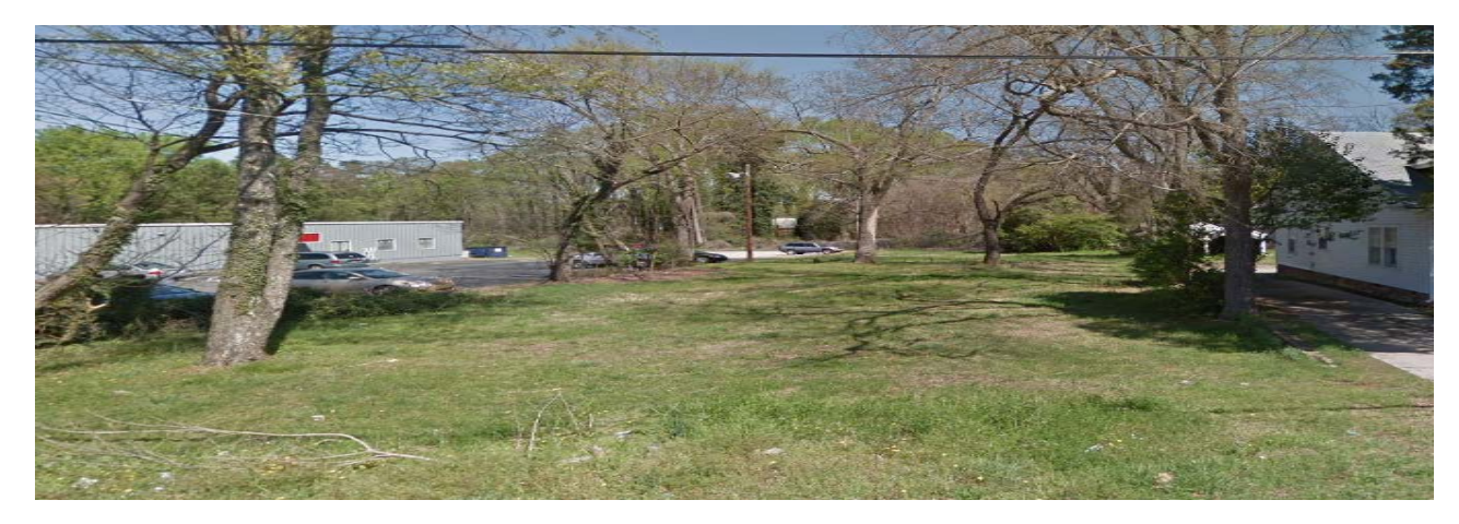
The subject property is vacant.