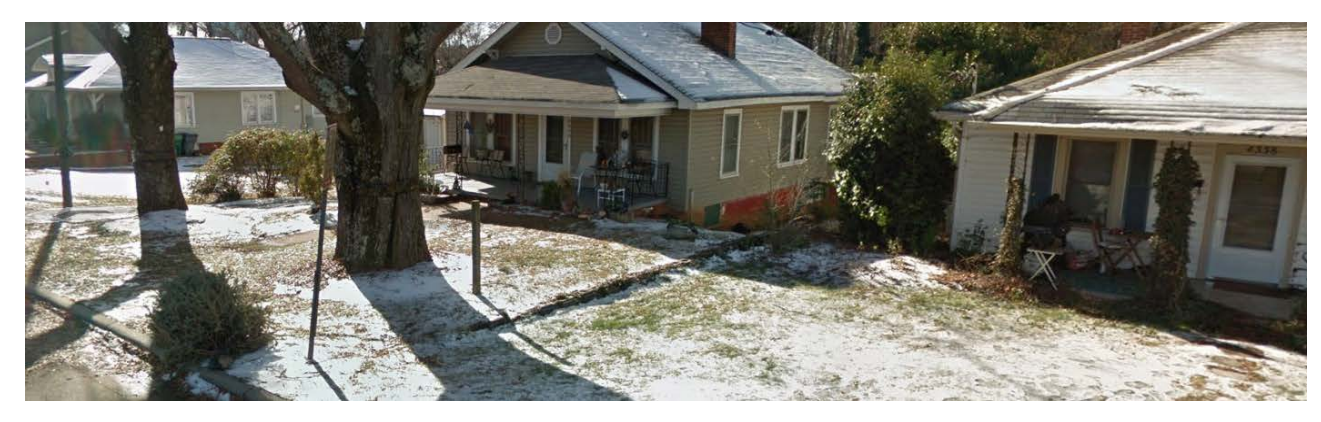
Properties to the north are single family and multi-family uses.