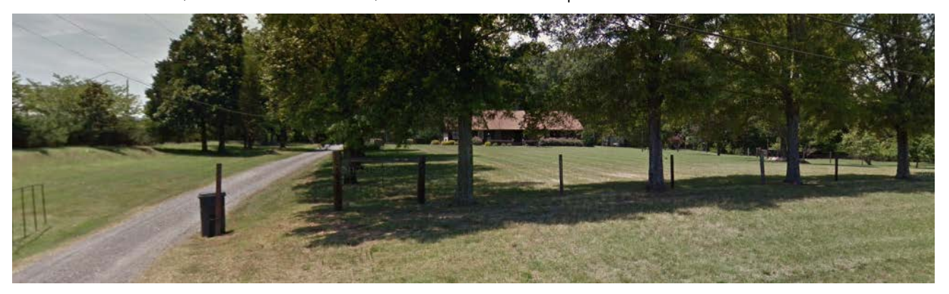
The subject property is developed with a large lot single family home.

• A portion of the site is developed with one single family detached home; the remainder of the site is vacant. The rezoning site abuts Southwest Middle School and Steele Creek Library to the south, and is surrounded by a mix of single family neighborhoods, apartment communities, institutional, office and retail uses, and vacant/undeveloped land.