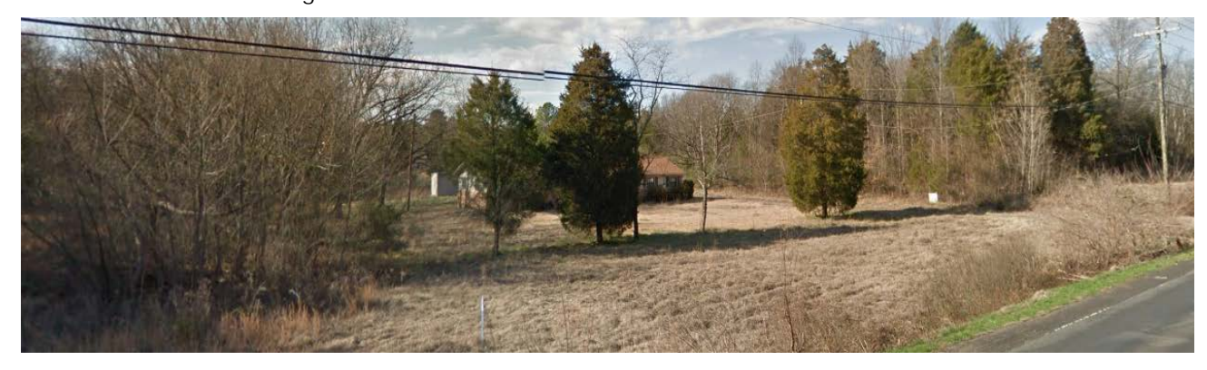
Areas to the north are developed with large lot single family homes and vacant land.