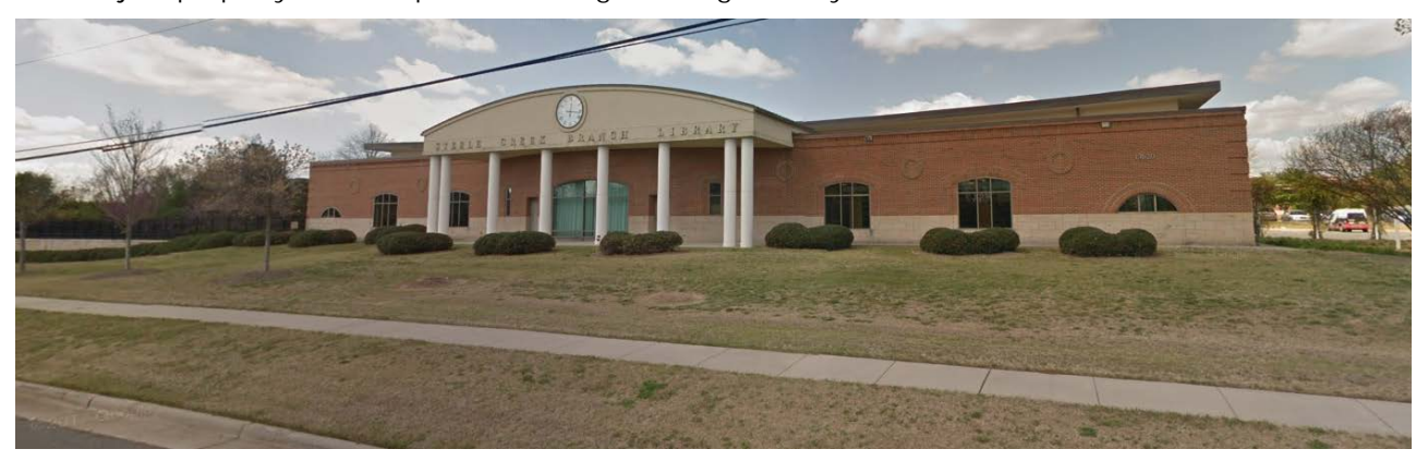
Steele Creek library and Southwest Middle School are to the south of the property.