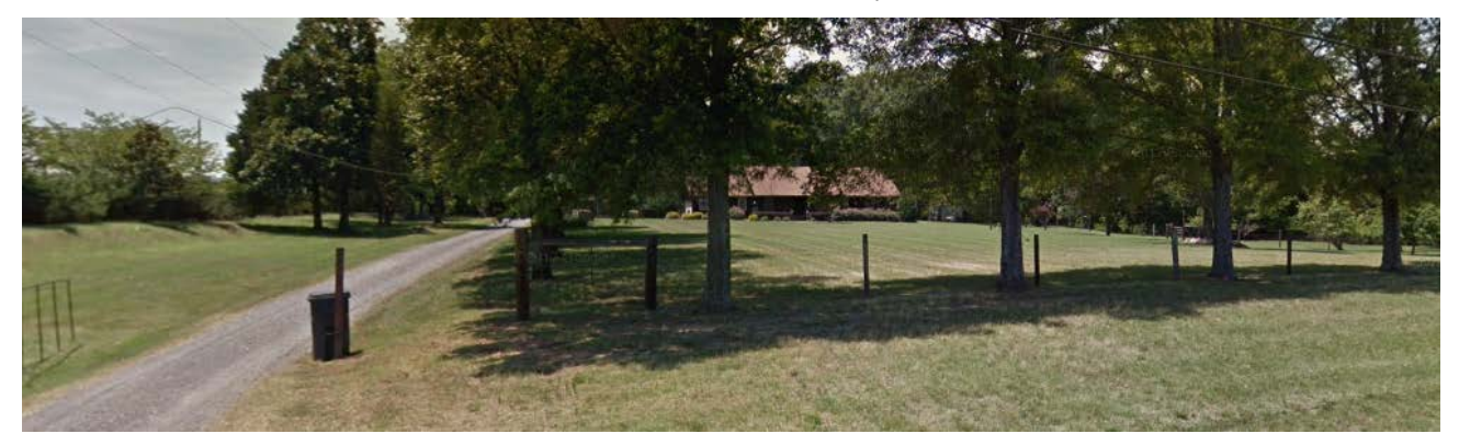
The subject property is developed with a large lot single family home.

• A portion of the site is developed with one single family detached home; the remainder of the site is vacant. The rezoning site abuts Southwest Middle School and Steele Creek Library to the south, and is surrounded by a mix of single family neighborhoods, apartment communities, institutional, office and retail uses, and vacant/undeveloped land.