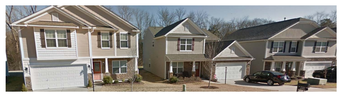
A single family neighborhood is to the west.