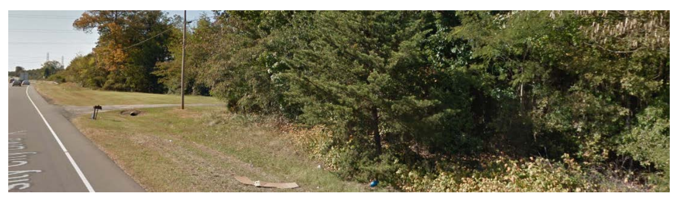
Properties to the north are mostly vacant with some single family homes and a cemetery.