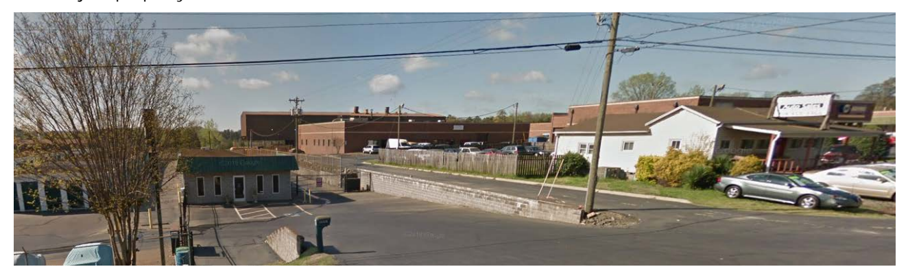
A vacant property is adjoining the subject site to the east. Further east, in Cabarrus County, the properties are a mix of commercial, retail, and industrial uses.