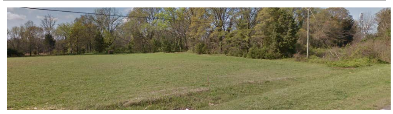
The subject property is vacant.

Petition 2018-035 (Page 3 of 5) Final Staff Analysis