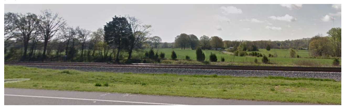
The subject property is bordered to the south by the railroad.