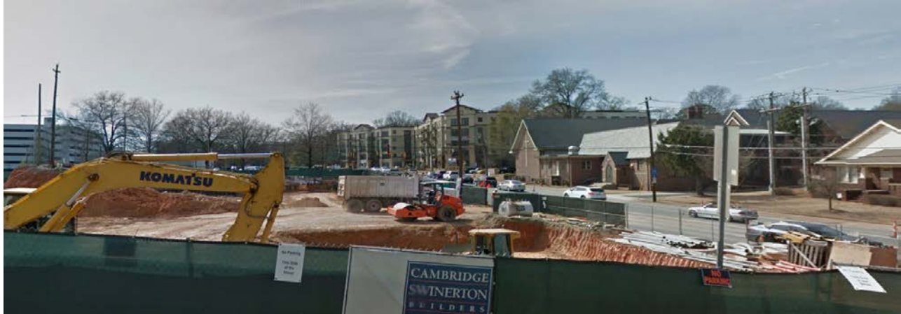
The property to the south is under construction with 380 dwelling units and commercial uses.