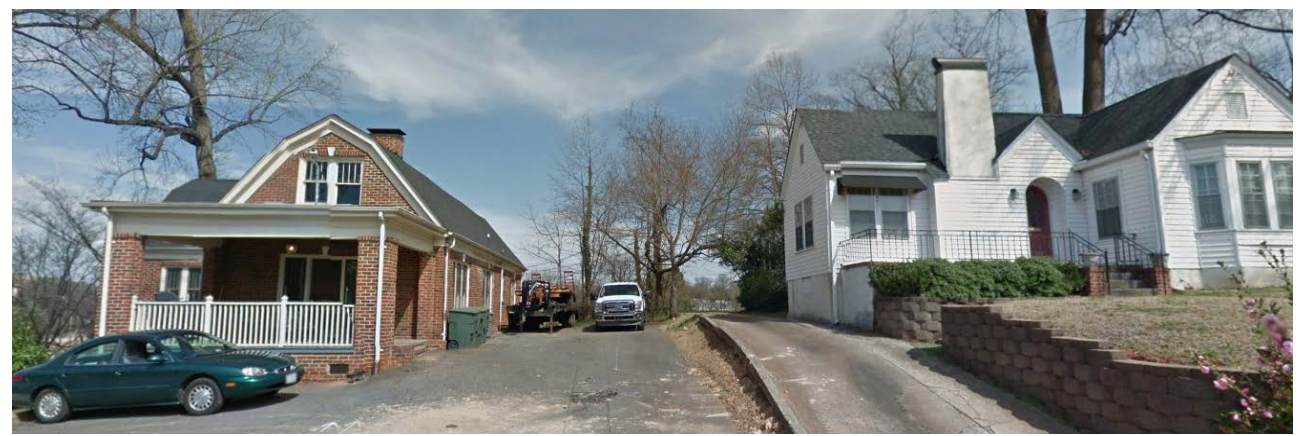
The subject site is developed with an office use.