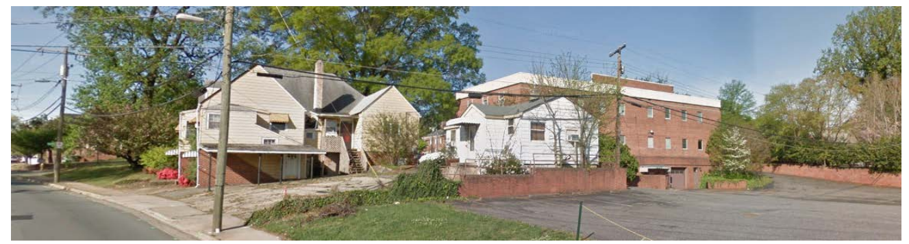
Properties to the north and west are developed with a mix of residential, office, and institutional.