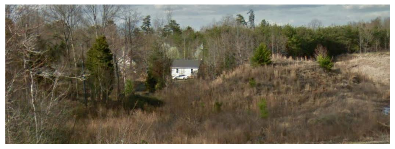
The site is developed with two single family homes, a cell tower, and vacant land.

• The site is developed with two single family homes, a cell tower, and vacant land. The site is surrounded by vacant land and I-485 to the east, and vacant land and Berewick Regional Park to the north. Berewick Elementary School is located to the west, and Berewick Town Center and Charlotte Premium Outlets are to the south.