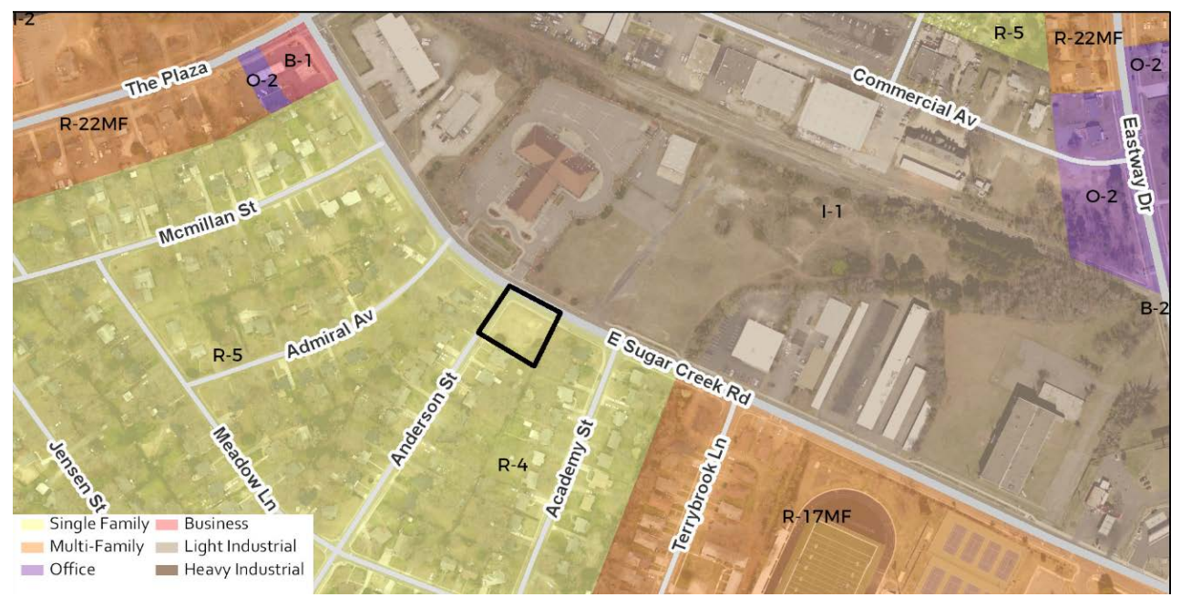
The subject property is vacant and is zoned R-4 (single family residential).

Surrounding properties on the south side of E. Sugar Creek Road contain single family, duplex, multifamily dwellings, a public school, and a retail store. Industrial, retail, and religious institution uses exist on the north side of E. Sugar Creek Road in industrial zoning.