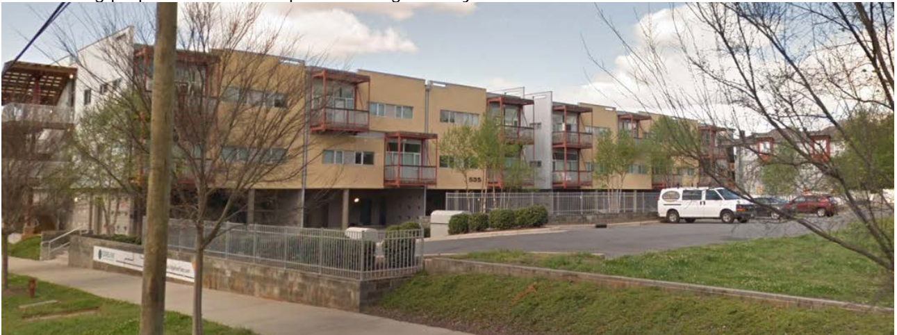
Multi-family dwellings are located nearby.