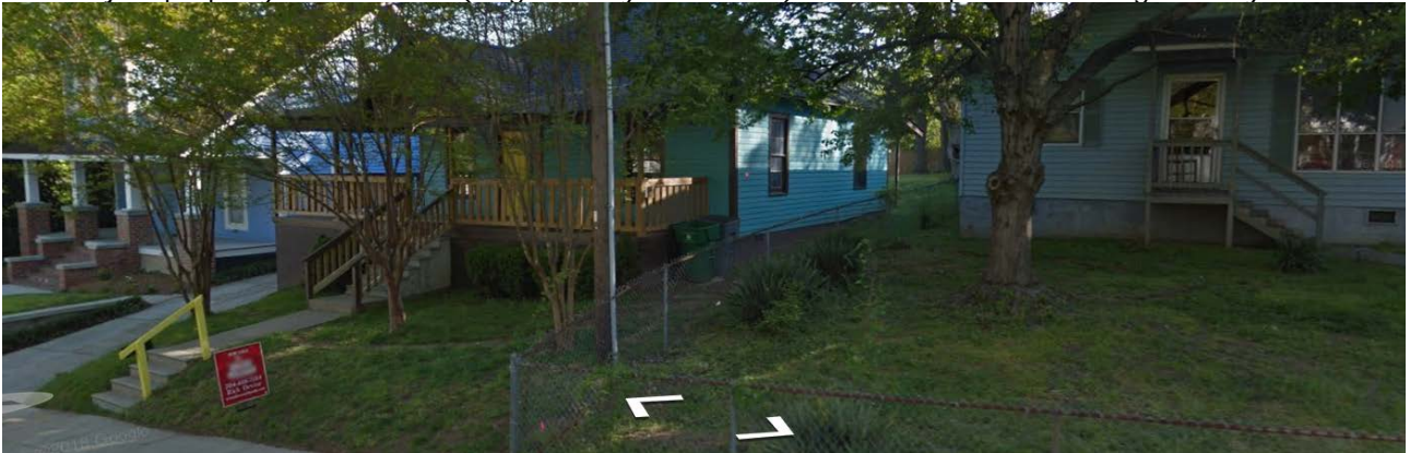
Surrounding properties are developed with single family homes.