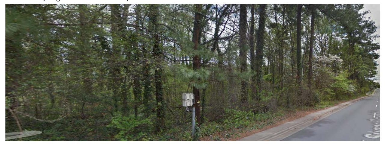
The subject property is vacant.