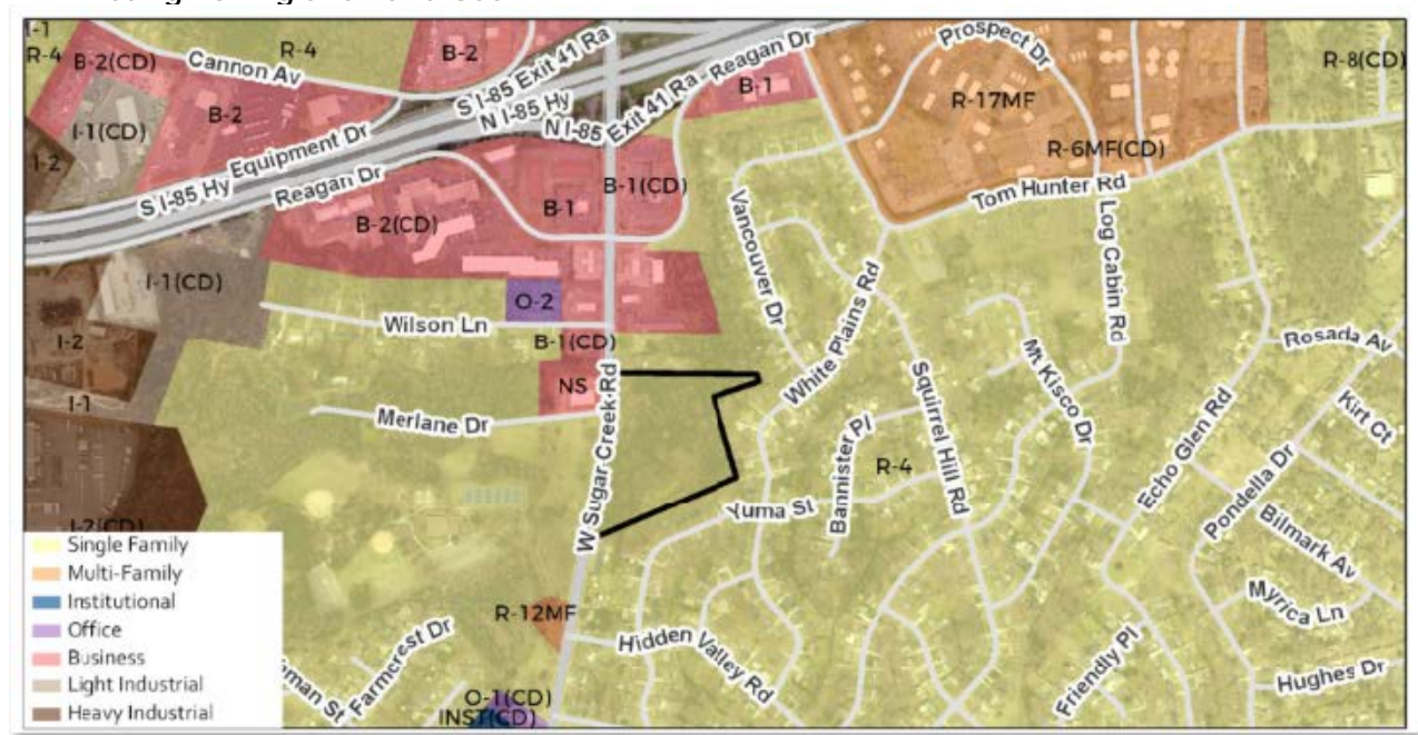
The subject property is vacant and zoned R-4 (single family residential). The surrounding properties are zoned single family residential with the exception of the property across W. Sugar Creek Road which is zoned NS (neighborhood services).