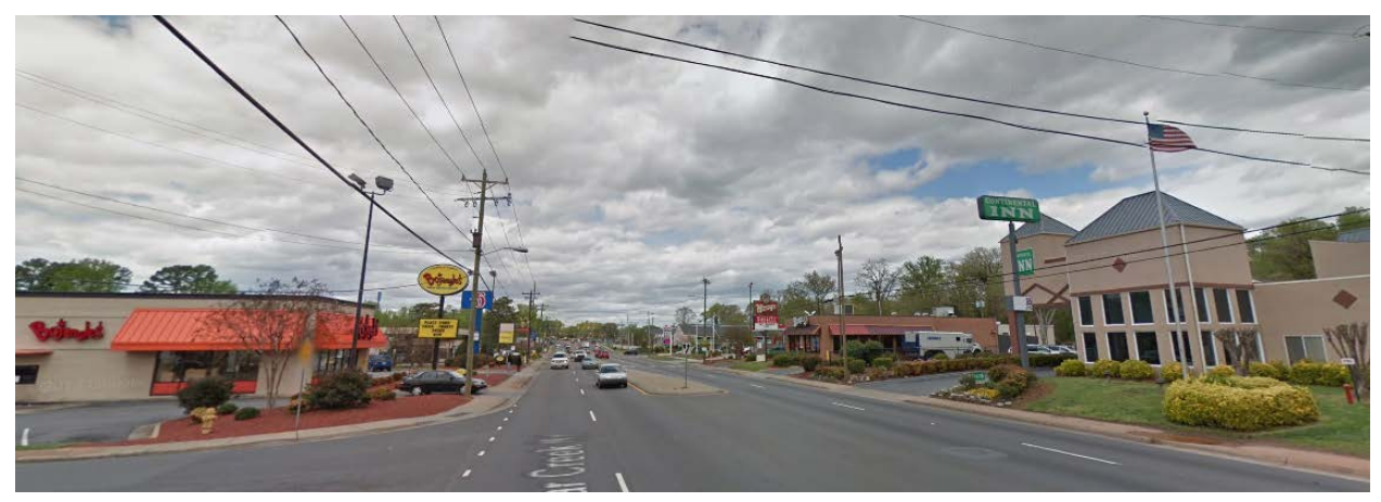
Highway commercial uses are located south of Interstate 85 and north of the property.