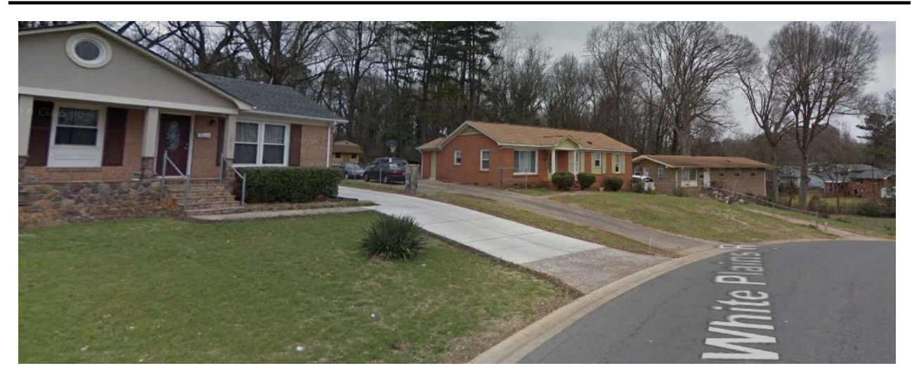
A single family subdivision abuts the property to the east and south.

Petition 2017-190 (Page 4 of 7) Final Staff Analysis