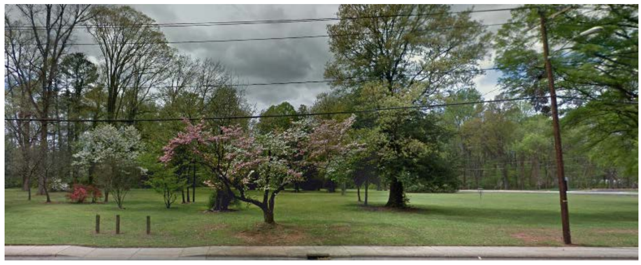
Sugaw Creek Community Park is located across the street from the property.