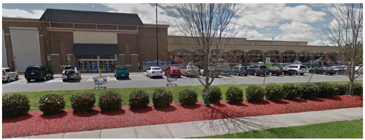
To the east is the Walmart shopping center.

Petition 2017-181 (Page 4 of 6) Final Staff Analysis