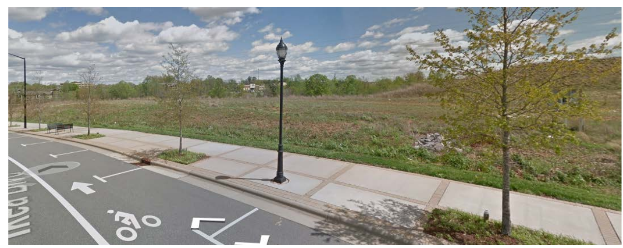
The subject property is vacant.

Petition 2017-181 (Page 3 of 6) Final Staff Analysis