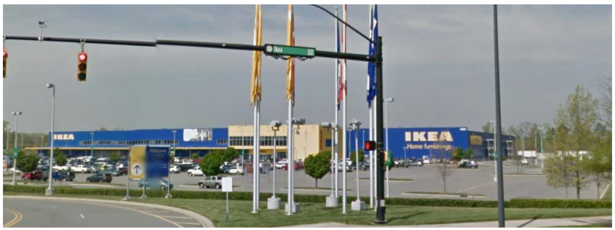
To the south is the Ikea retailer.