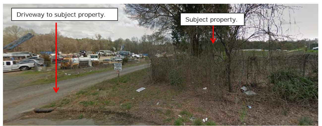
The subject parcel is at the end of Cressida Drive with a small amount of street frontage, and is occupied by a contractor's storage yard.

The subject property is zoned I-1 and is adjoining properties zoned for industrial to the north and west. To the south and east of the subject property, the areas are zoned for single family and multi-family residential respectively.