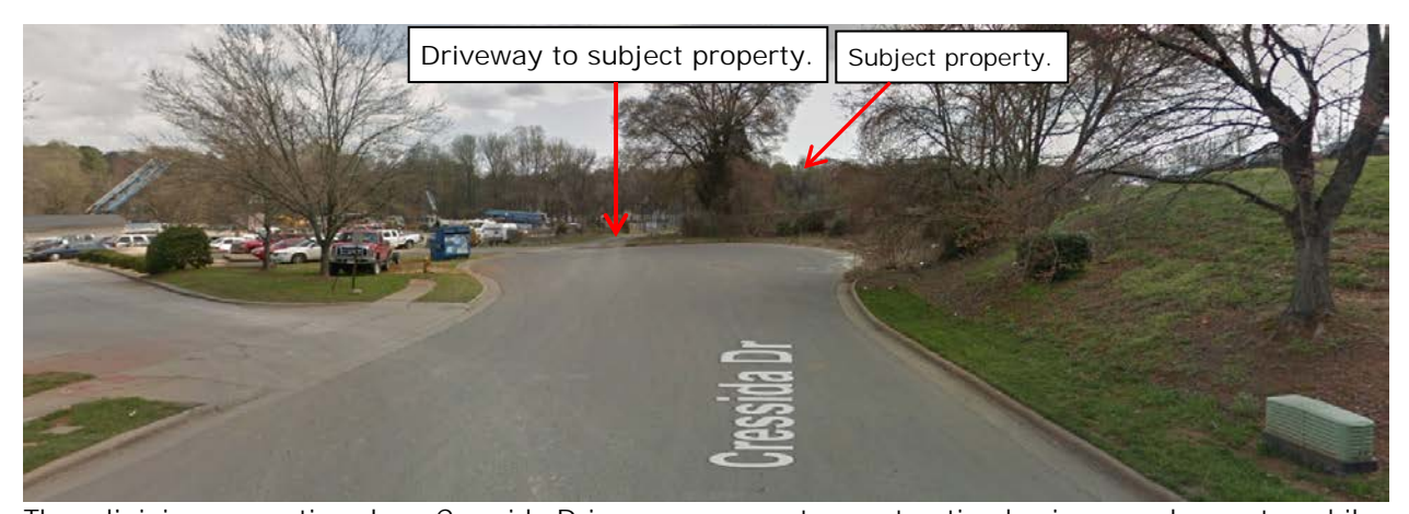
The adjoining properties along Cressida Drive are a concrete construction business and an automobile dealership. Residential properties adjoing the site to the east and south and are not visible from Cressida Drive.