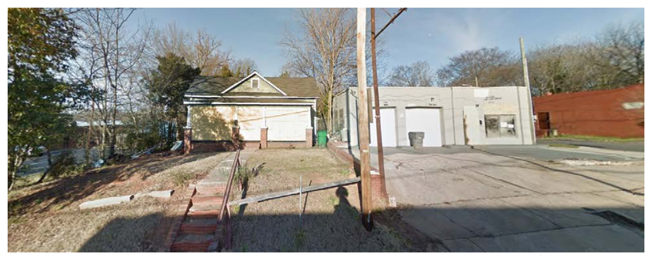
923 Belmont Avenue – A service garage and single family home are located in B-1 (neighborhood business).

Petition 2017-172 (Page 3 of 6) Final Staff Analysis