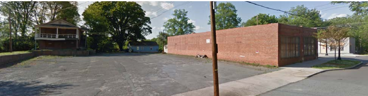
1035 Harrill Street – A commercial structure is located in B-1 (neighborhood business)