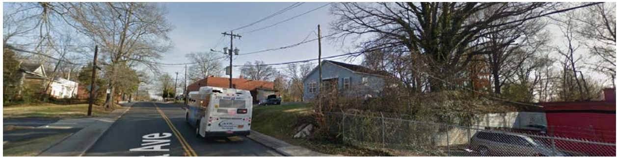
Properties to the north of the subject property include one single family home, a church, and a convenience store.