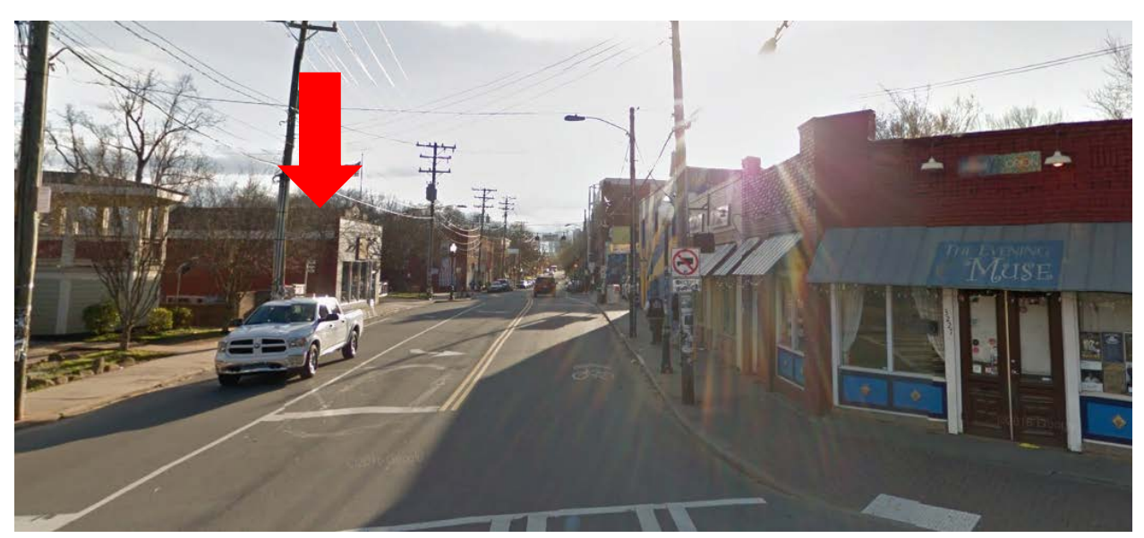
Surrounding properties on either side of North Davidson Street are developed with office, commercial/retail, eating/drinking/entertainment establishments, indoor recreation, warehouse, residential uses and a fire station. (Red arrow points to the subject property.)

Petition 2017-163 (Page 3 of 6) Final Staff Analysis