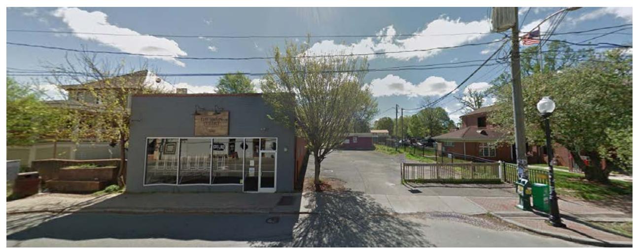
The subject property is developed with an eating/drinking/ entertainment establishment and associated parking.

Petition 1998-29 rezoned the subject properties from B-1 (neighborhood business) to NS (neighborhood business) to allow all uses permitted in the B-1 (general business) district, with the exception of gas stations, drive-through windows, adult books and entertainment. The subject property is currently developed with an eating/drinking/entertainment/commercial use.