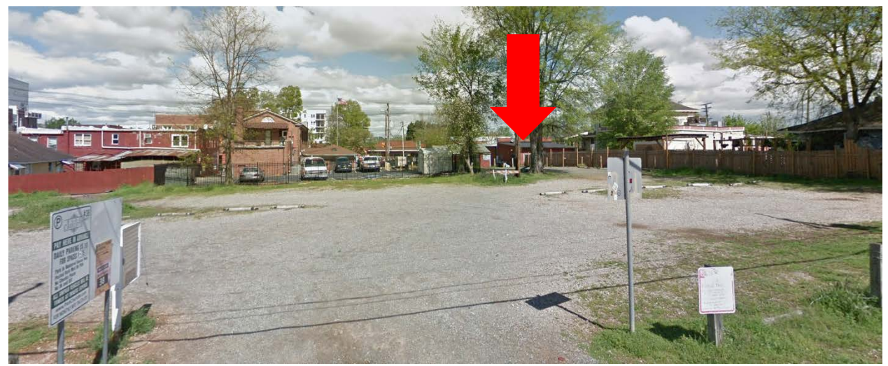
A parking lot and other commercial uses are located behind the subject properties along Yadkin Avenue. (Red arrow points to the subject property.)