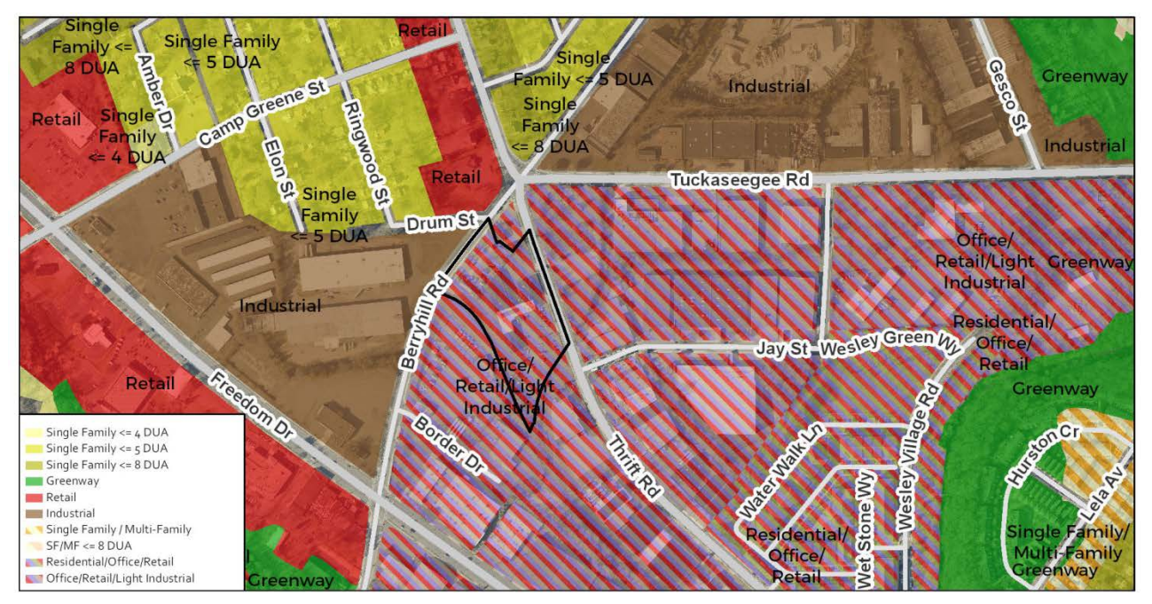
• The Bryant Park Land Use & Streetscape Plan (2007) recommends a mix of office/retail and light industrial uses for this site.