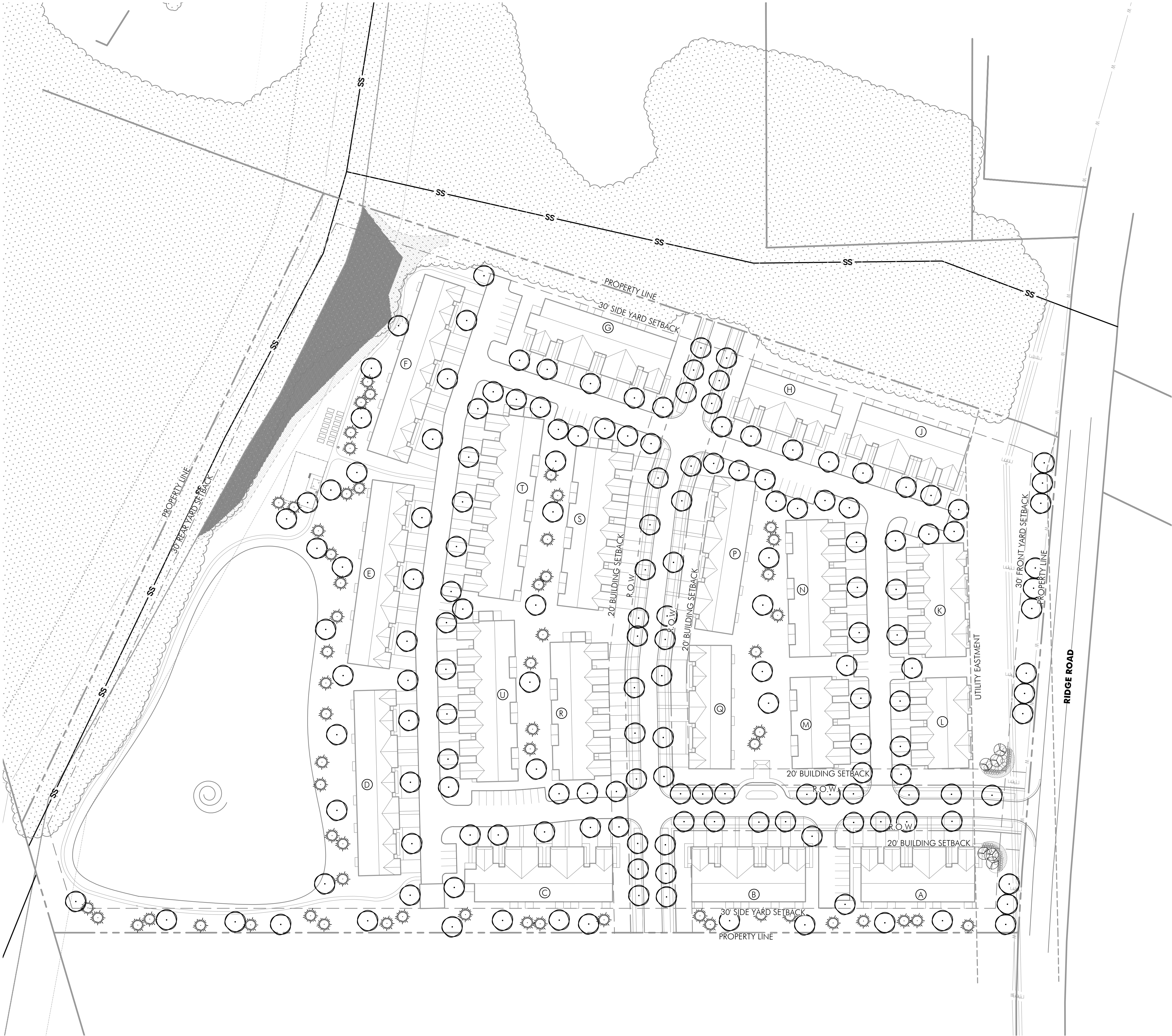
Conceptual Landscape Plan SCALE: 1" = 50'