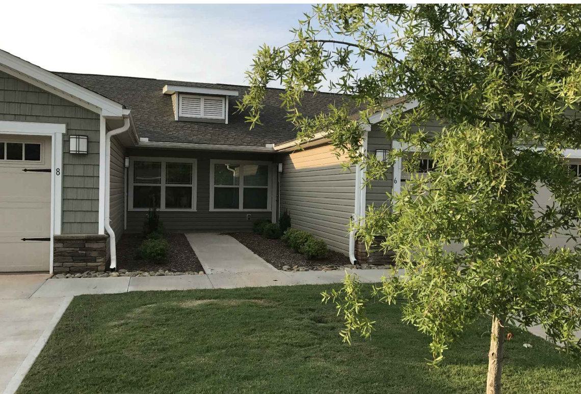
Current Communities In North Carolina and South Carolina