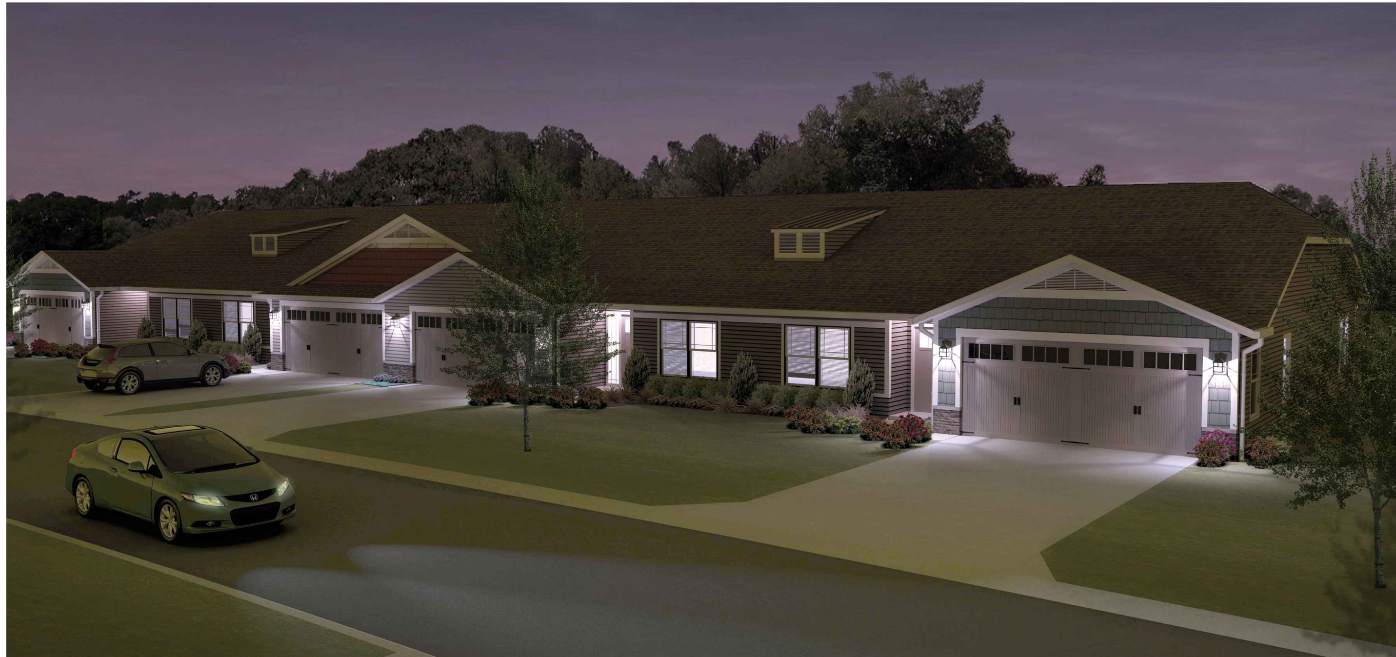
Representative Architectural Style Perspectives