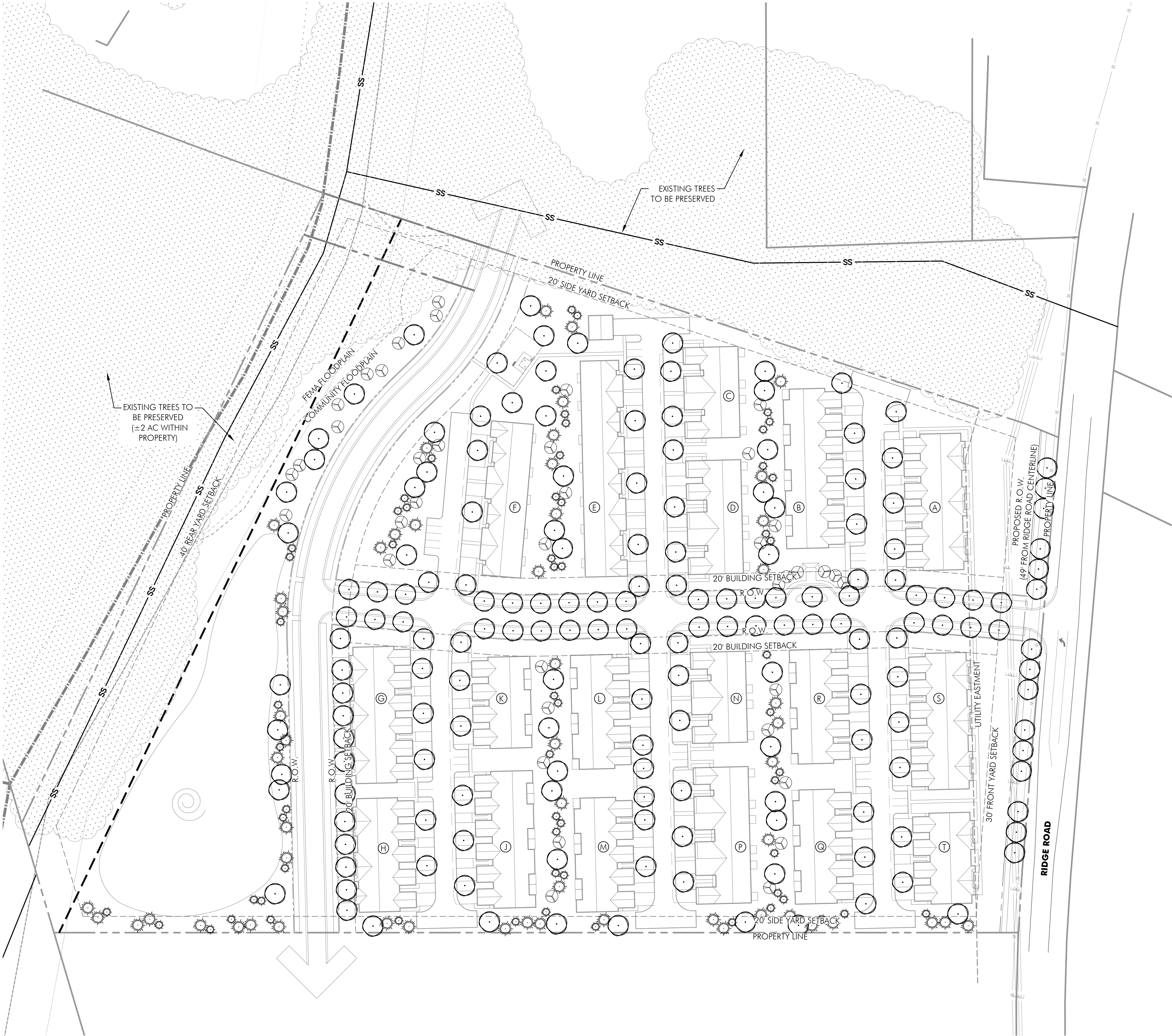
Conceptual Landscape Plan SCALE: 1" = 50'