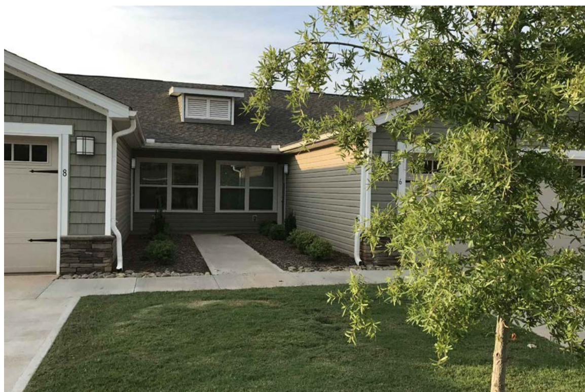
Current Communities In North Carolina and South Carolina