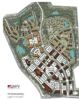
A site plan for Farmington.

And the biggest new mixed-use development being planned, the River District near I-485 and West Boulevard, is expected to transform 1,400 acres and add millions of square feet of office space, thousands of residences, 1,000 hotel rooms and 500,000 square feet of shops and restaurants.