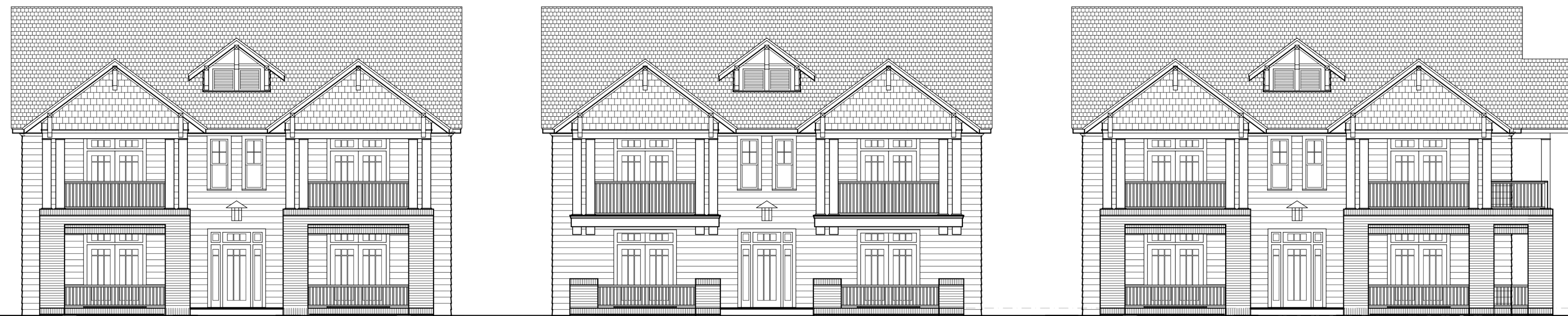
1 A1 FRONT ELEVATIONS NTS