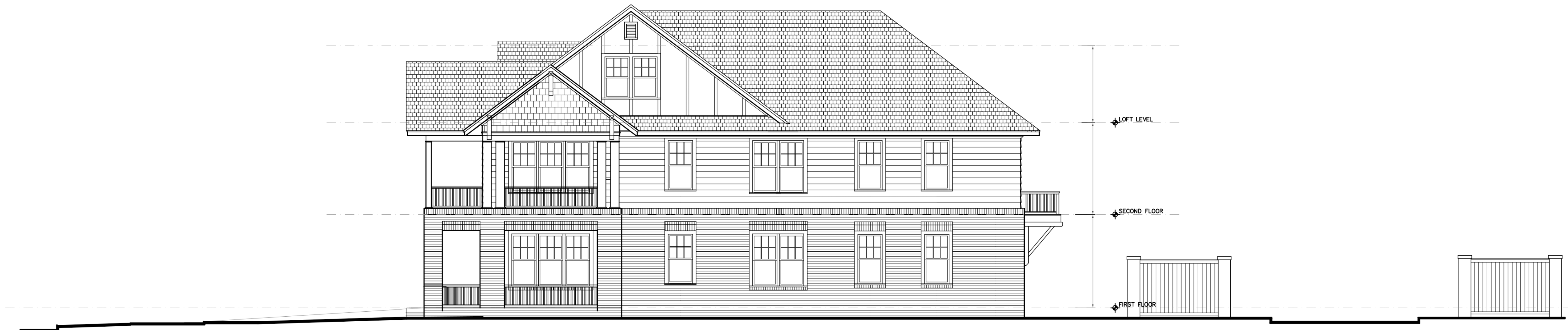
2 A1 ST. JULIEN ELEVATION NTS