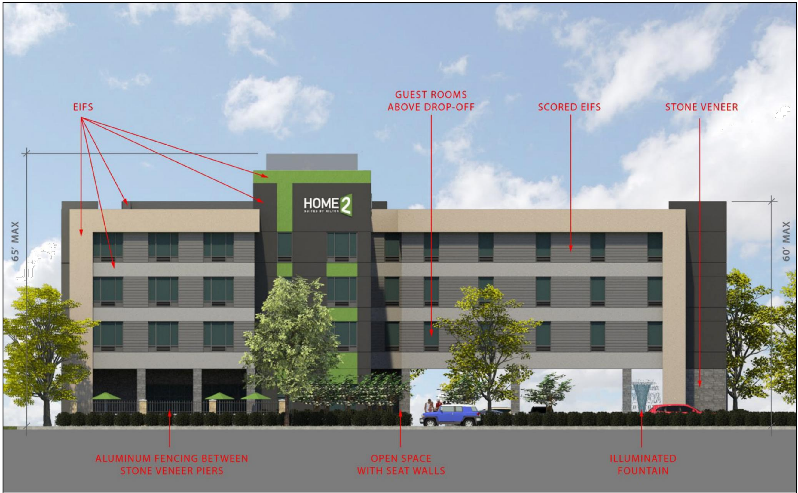
02 EXTERIOR RENDERED ELEVATION - REA ROAD scale: NTS