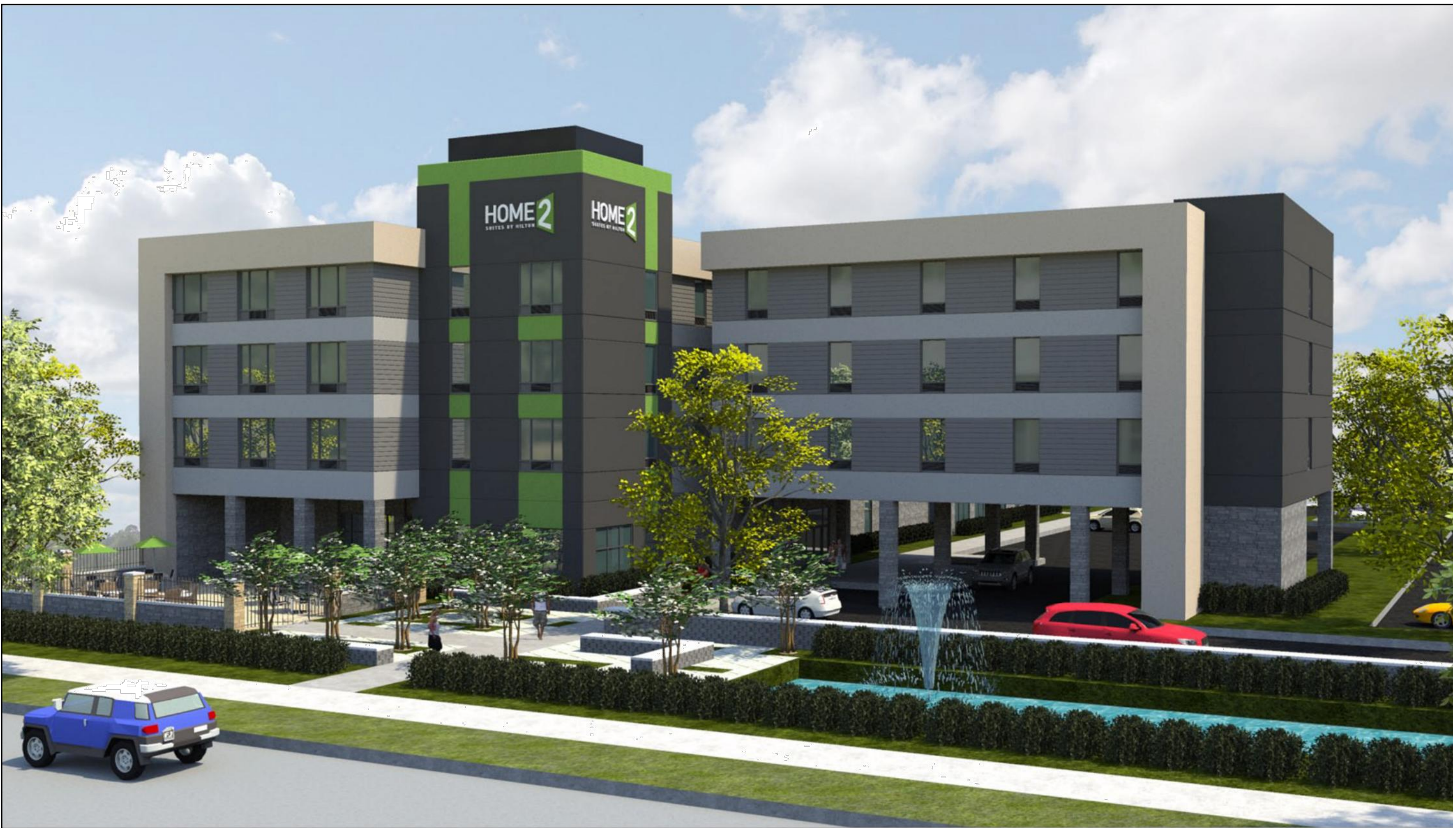
01 EXTERIOR RENDERING - REA ROAD scale: NTS