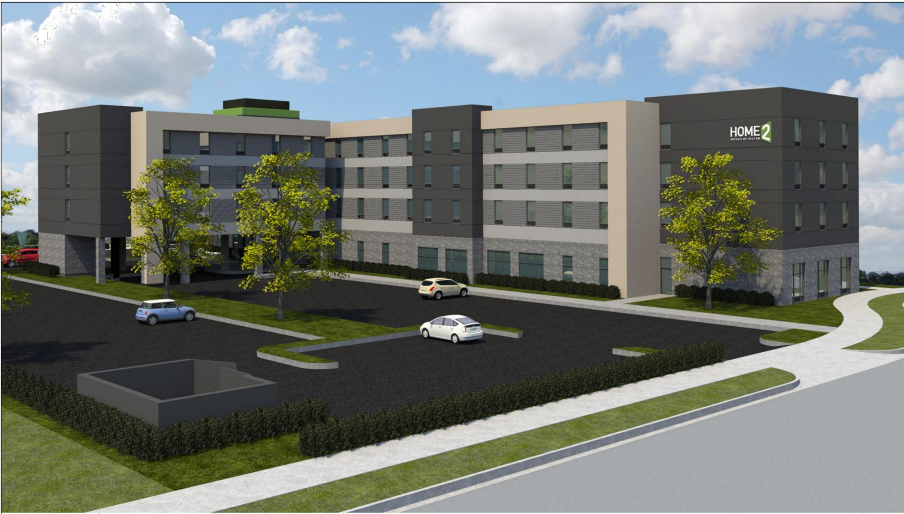
03 EXTERIOR RENDERING - PIPER STATION scale: NTS