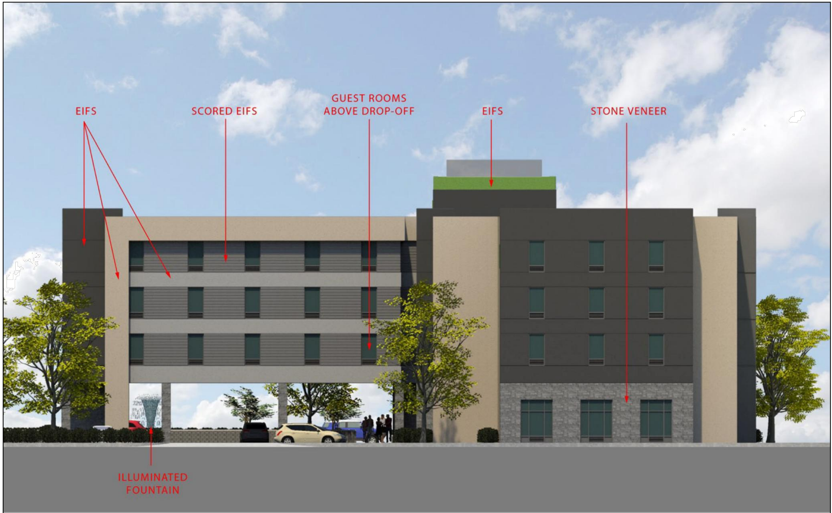
04 EXTERIOR RENDERED ELEVATION - PIPER STATION scale: NTS