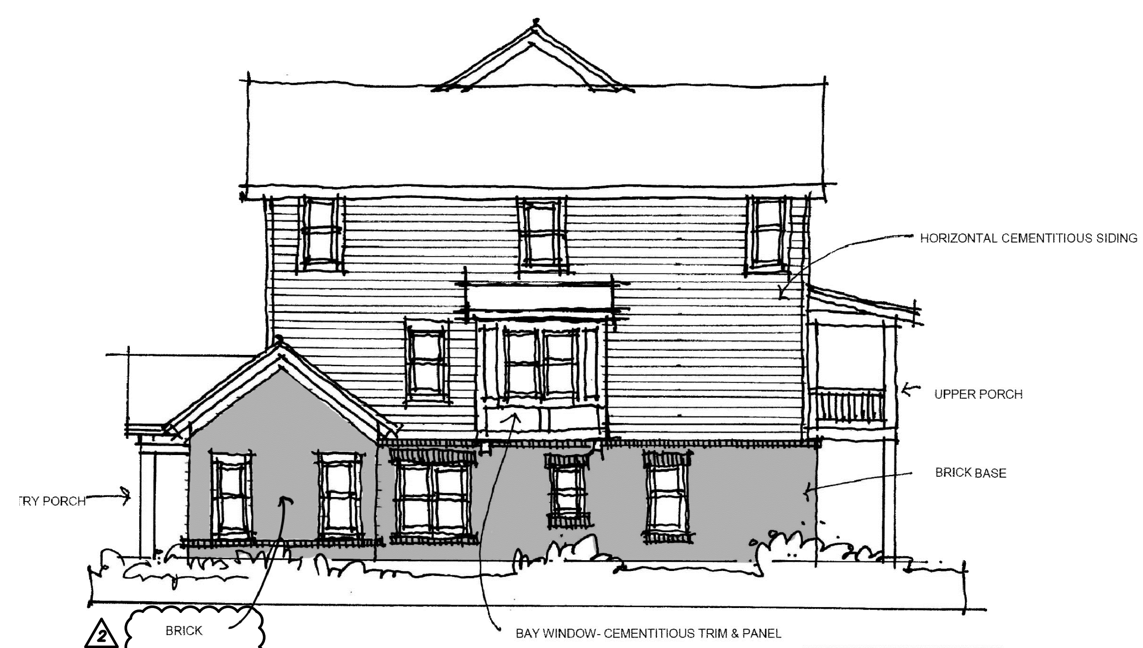
SIDE ELAVATION 3 1/8" = 1'-0"