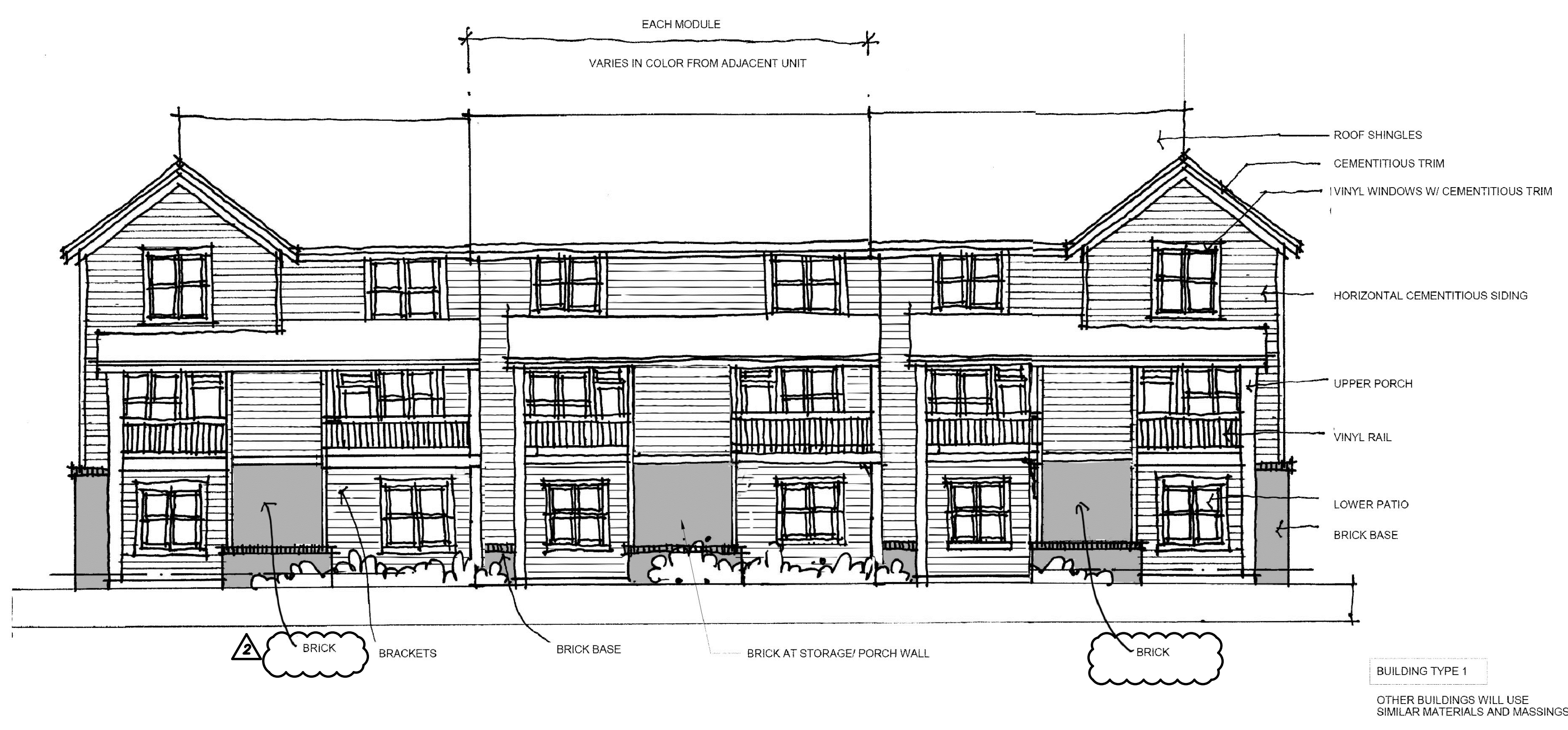
REAR ELEVATION. 2 1/8" = 1'-0"

DRAWN BY: DG/LC CHECKED BY: CJ/JW BUILDING TYPES & ELEVATIONS