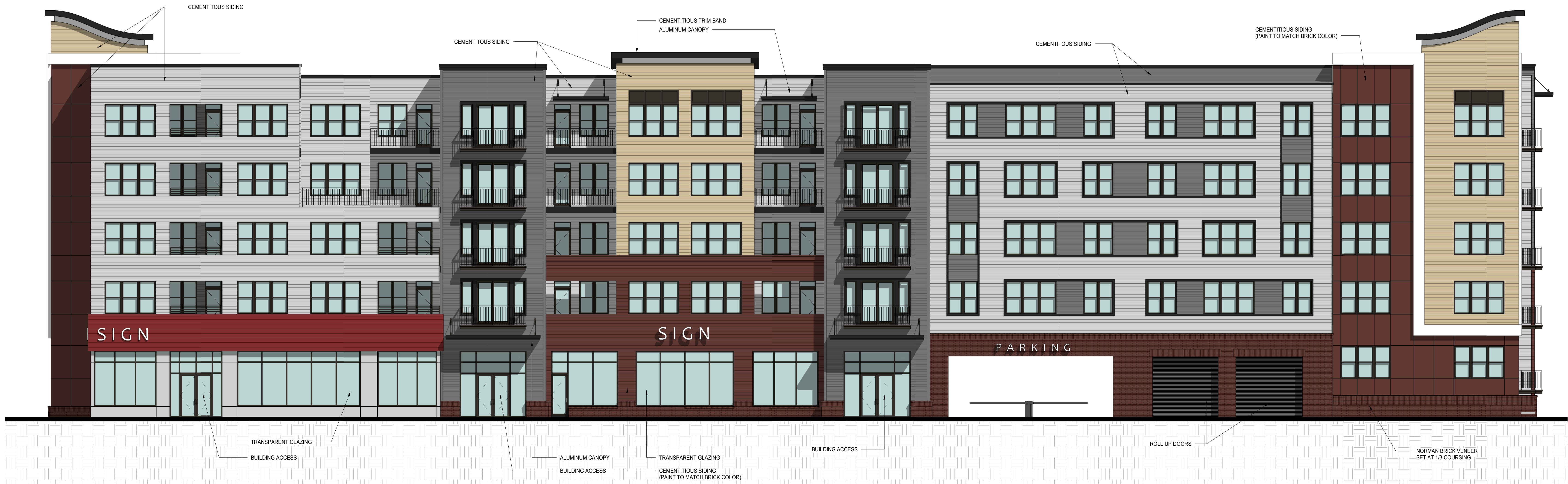
NORTH ENLARGED 1/8" = 1'-0"

Atapco University Executive Park Tryon Street Charlotte, NC