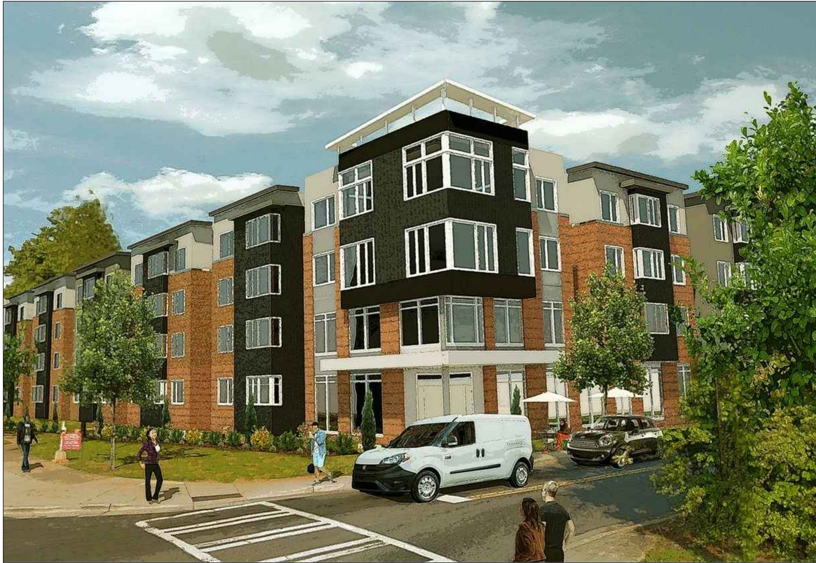
SUTHER RD. CORNER ENTRY - CONCEPTUAL PERSPECTIVE