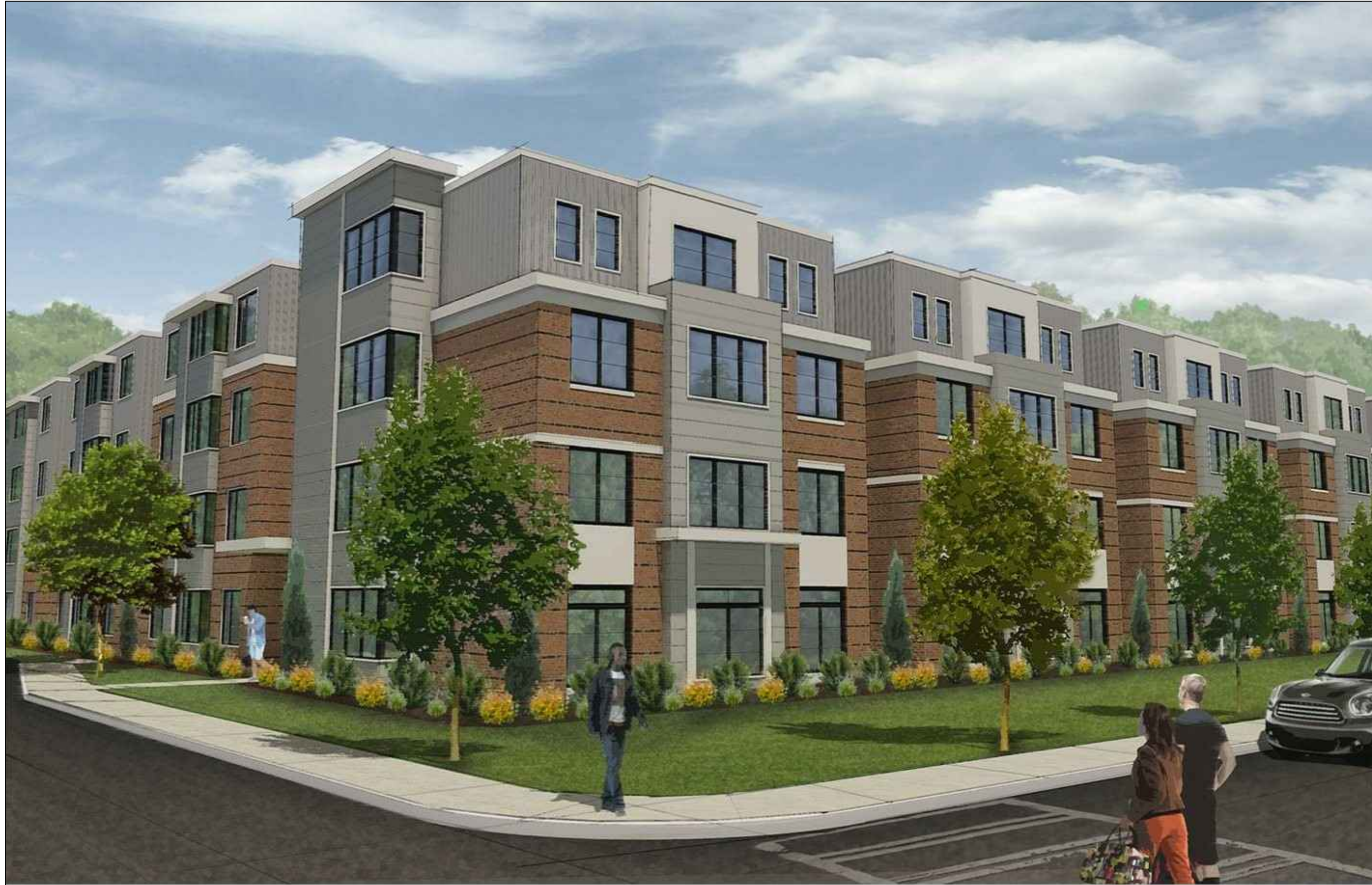
SANDBURG AVE. & SUTHER RD. - CONCEPTUAL PERSPECTIVE