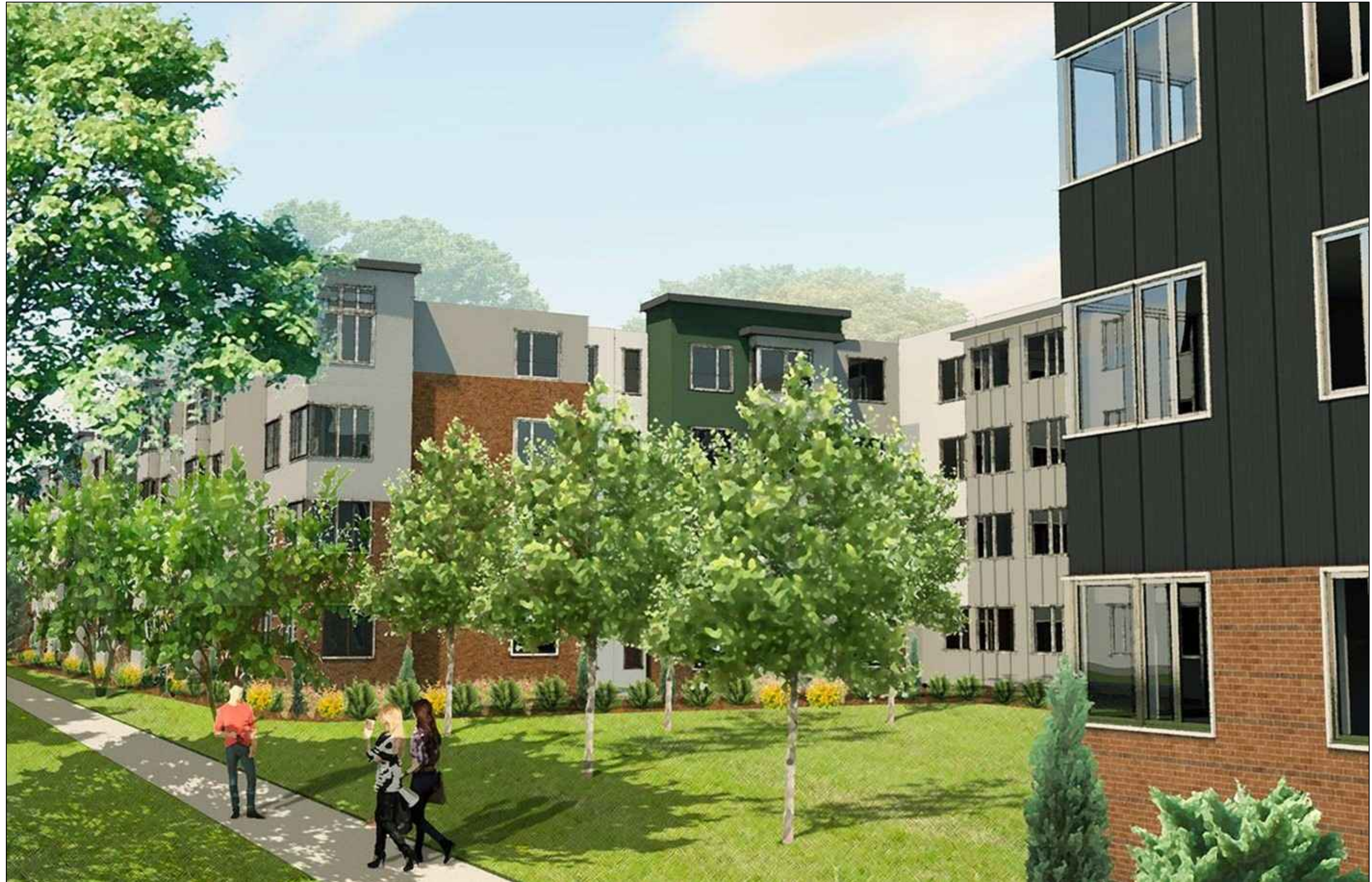
UNIVERSITY CITY BLVD. COURTYARD - CONCEPTUAL PERSPECTIVE

ARTIST'S RENDITIONS. ACTUAL BUILDING COLORS, MATERIALS AND DESIGN SUBJECT TO CHANGE. © 2016 KITCHEN AND ASSOCIATES. ALL PLANNING AND ARCHITECTURAL CONCEPTS SHOWN ARE THE INTELLECTUAL PROPERTY OF KITCHEN & ASSOCIATES. THIS DESIGN MAY NOT BE DUPLICATED OR INCORPORATED IN ANY OTHER PLAN OR DOCUMENT WITHOUT THE EXPRESS WRITTEN CONSENT OF KITCHEN & ASSOCIATES. NOTE: THESE ARE ILLUSTRATIVE/CONCEPTUAL RENDERINGS OF THE PROPOSED BUILDING AND SURROUNDING OPEN SPACE ASSOCIATED WITH THE DEVELOPMENT. THE EXACT DIMENSIONS AND CONFIGURATION ARE SUBJECT TO CHANGES DURING DESIGN DEVELOPMENT THAT DO NOT MATERIALLY CHANGE THE DESIGN INTENT.