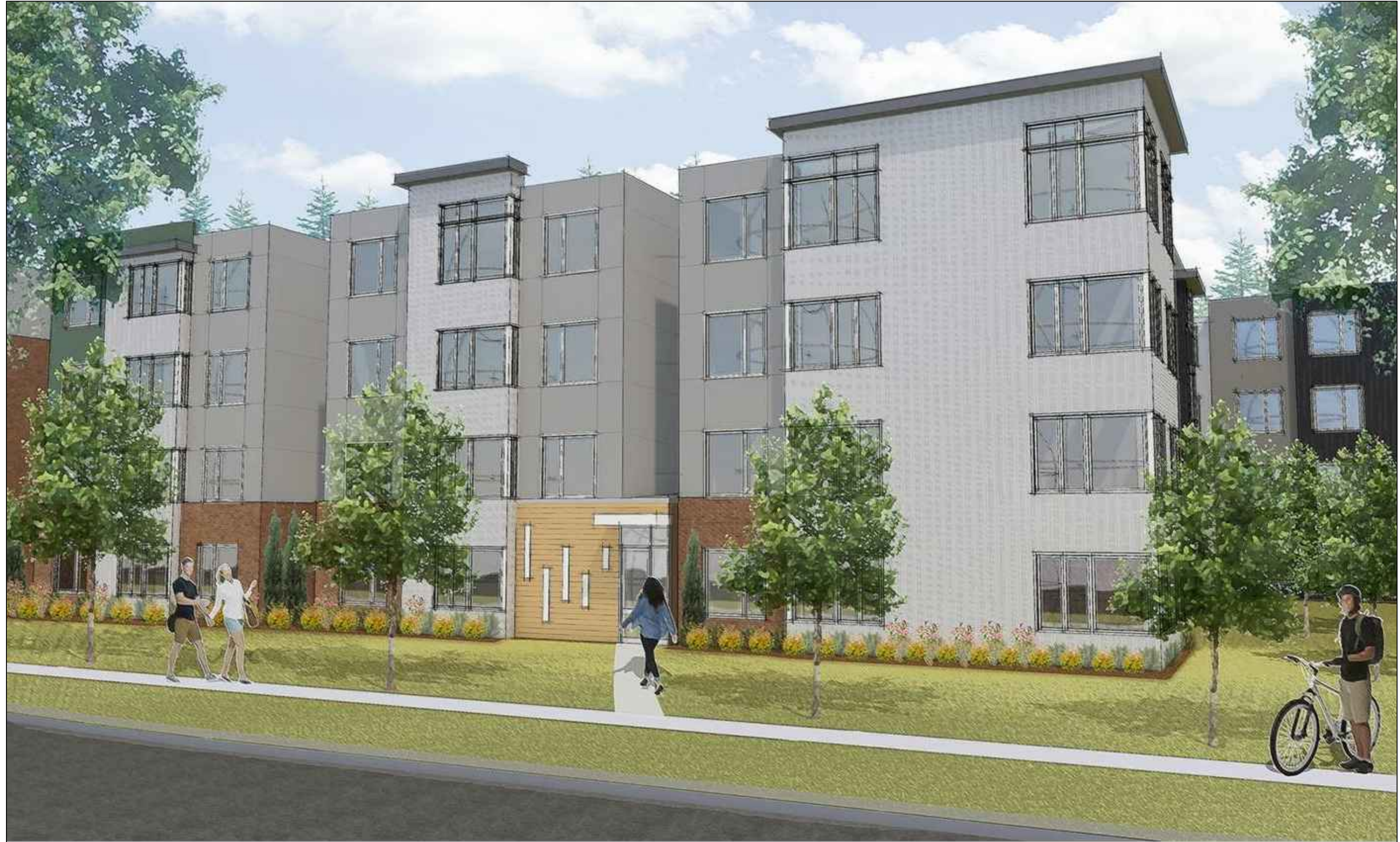
UNIVERSITY CITY BLVD. SECONDARY ENTRANCE - CONCEPTUAL PERSPECTIVE