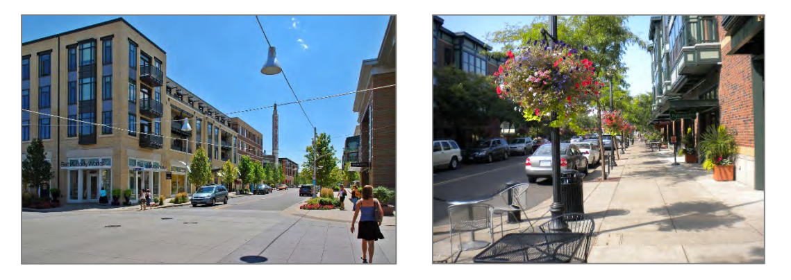
Sample Town Center Core Development Form and Public Realm

1. Town Center Core. The Town Center Core is the heart of the mixed-use walkable center with the highest intensity of uses and greatest emphasis on buildings oriented to streets. When feasible, a vertical mix of uses may be provided to promote active ground floor uses; however, active ground floor uses are not required so long as transparency requirements are met. See Streetscape by District Table (RZ-5B). The core area of the Town Center will occur in an area within the "Potential" area as generally depicted on [Sheet RZ-9]. The specific area may vary in exact size and location.