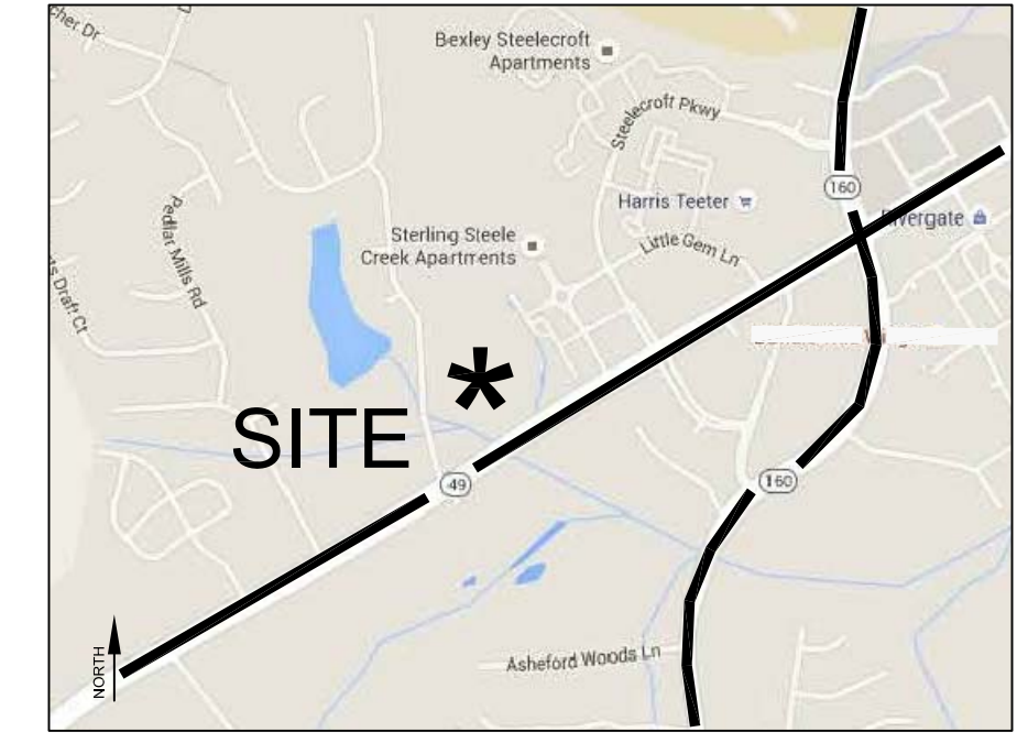
VICINITY MAP - NTS