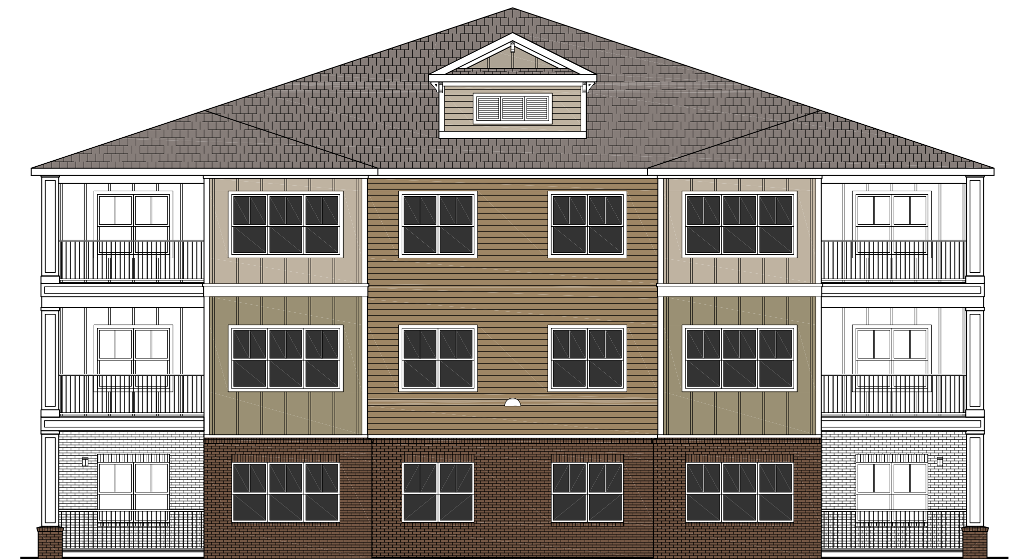
03 ELEVATION: Building Type II Right & Left 1/8" = 1'-0" (1/16" = 1'-0" when 11x17)