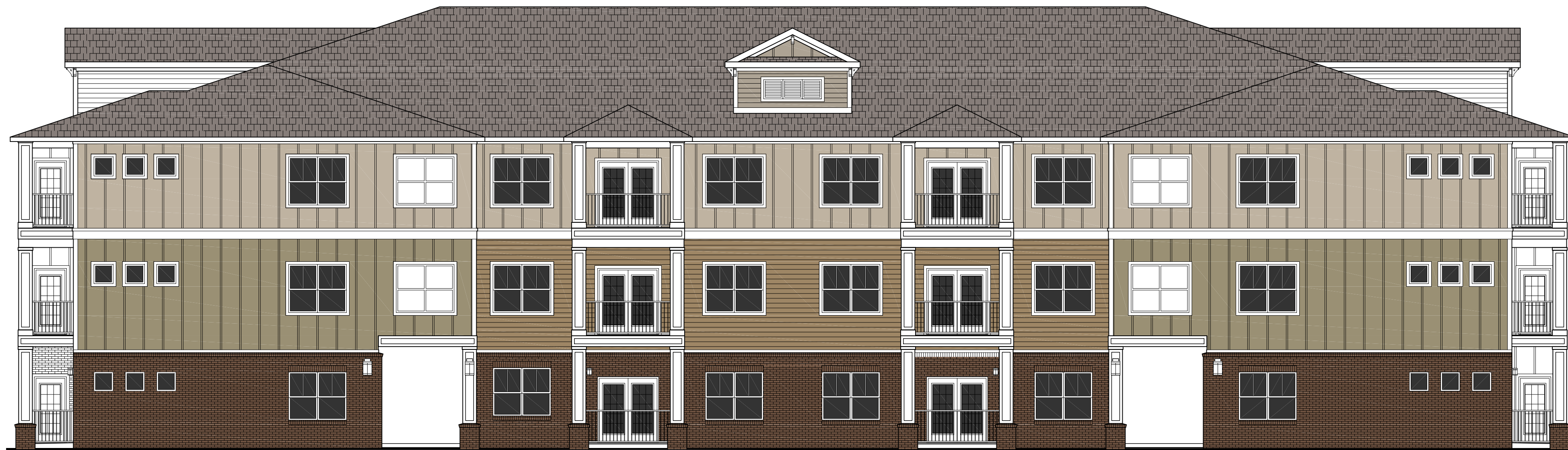
04 ELEVATION: Building Type II Front & Rear 1/8" = 1'-0" (1/16" = 1'-0" when 11x17)