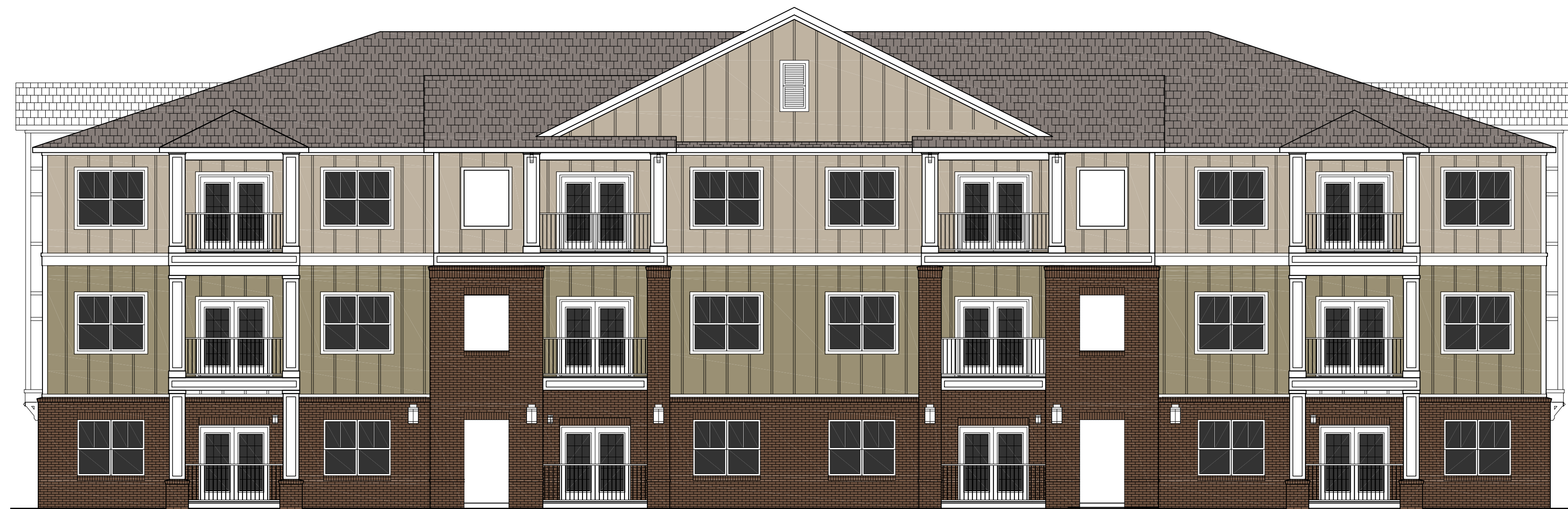
02 ELEVATION: Building Type I Front & Rear 1/8" = 1'-0" (1/16" = 1'-0" when 11x17)