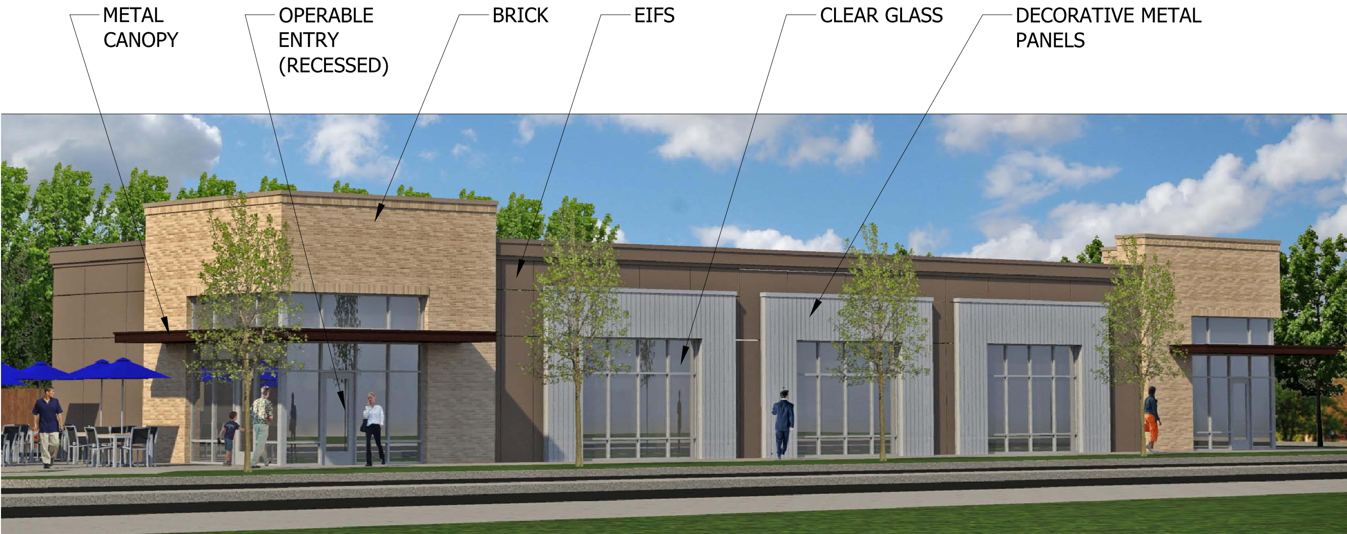
02 PARK ROAD ELEVATION SCALE: NTS