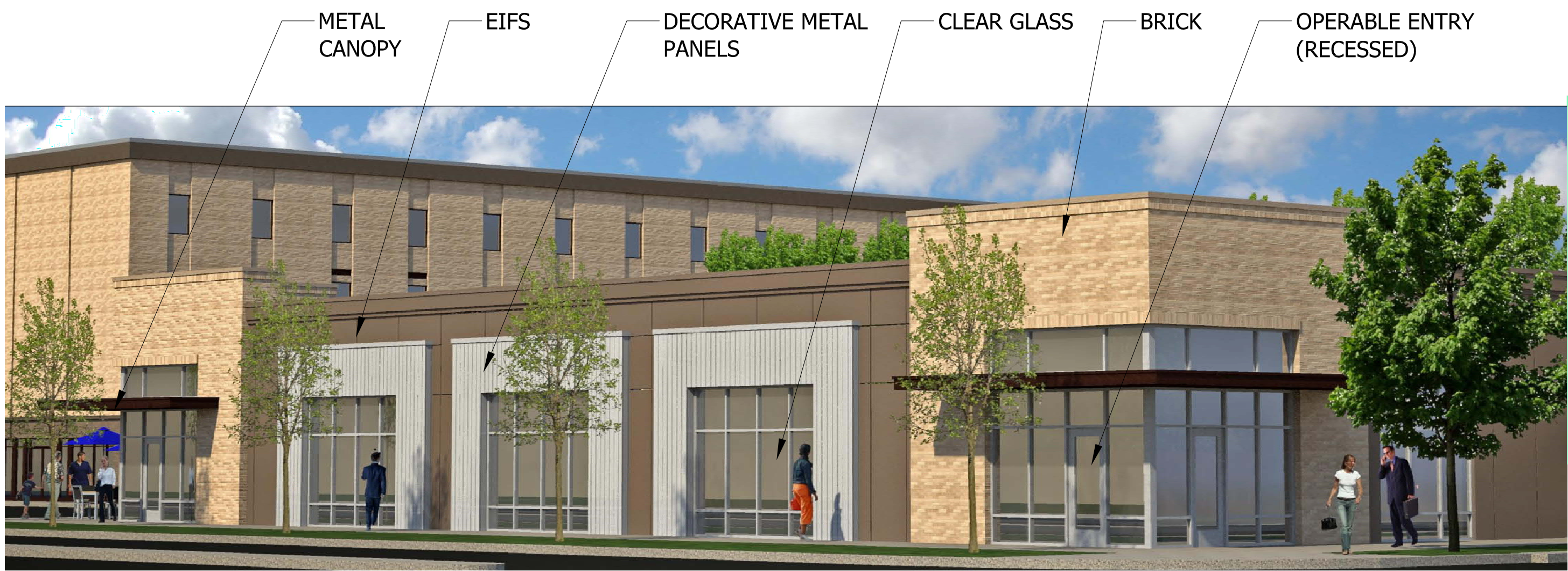
03 PARK ROAD & MONTFORD DRIVE ELEVATION SCALE: NTS