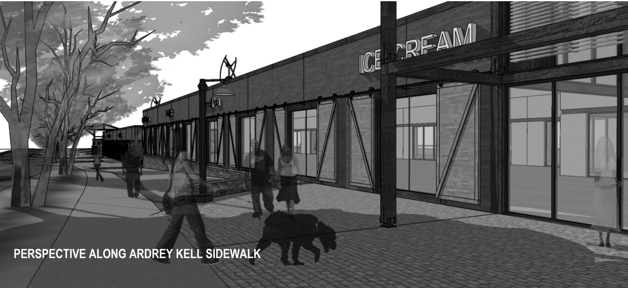
PERSPECTIVE ALONG ARDREY KELL SIDEWALK