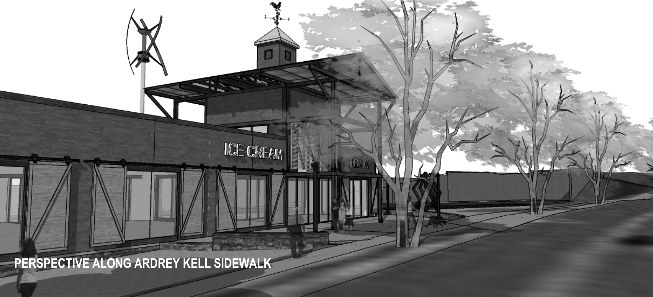
PERSPECTIVE ALONG ARDREY KELL SIDEWALK