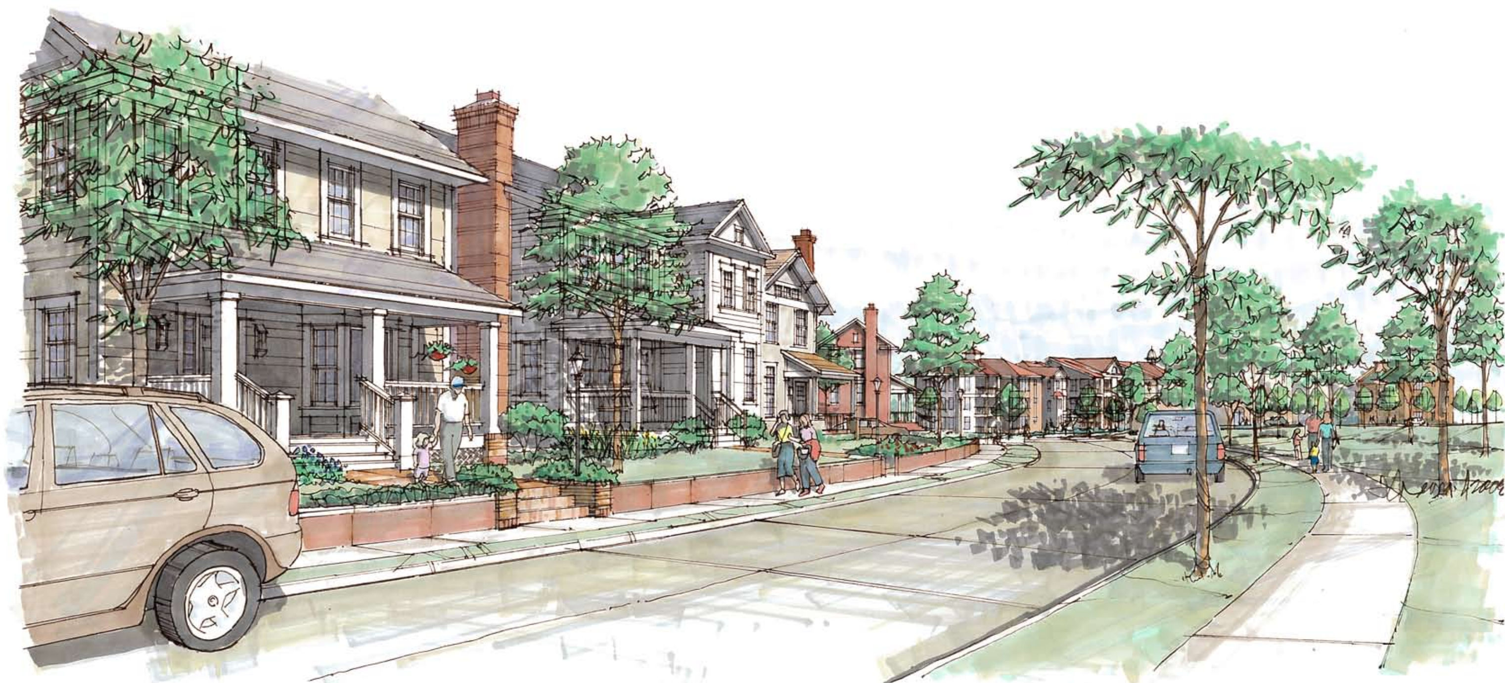
View - Woodward Ave. at Anita Stroud Park ▲