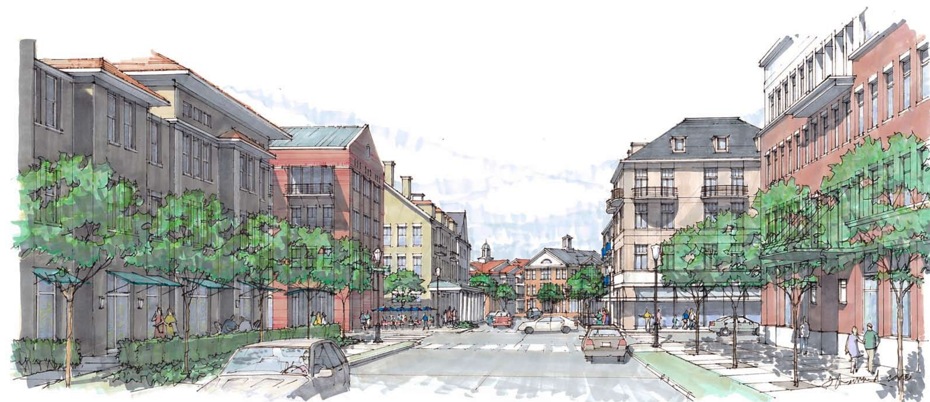
View - Kohler Avenue towards The McNeil Apartments at the Stateville Avenue Intersection ▲