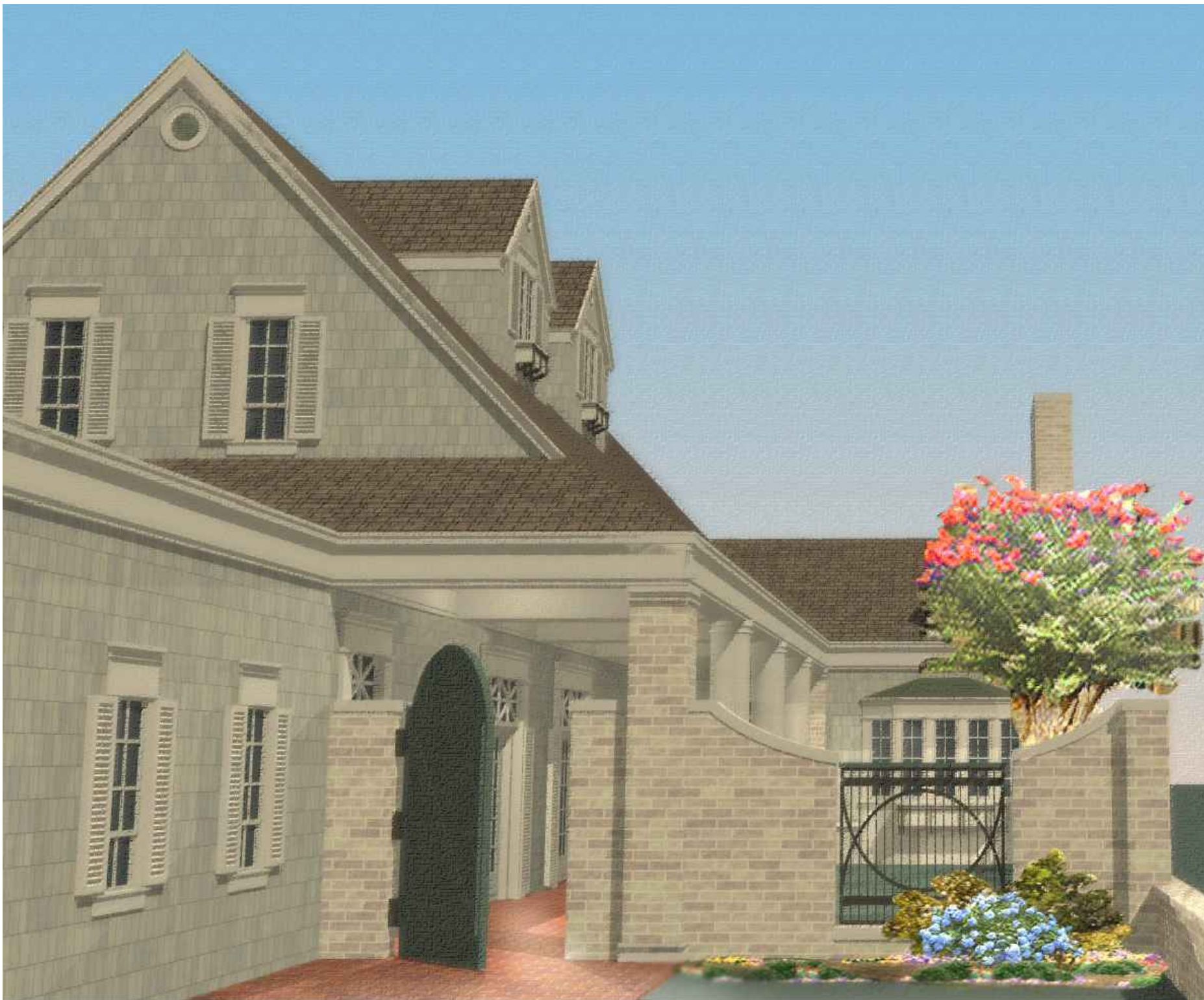
INTERIOR COURTYARD PERSPECTIVE