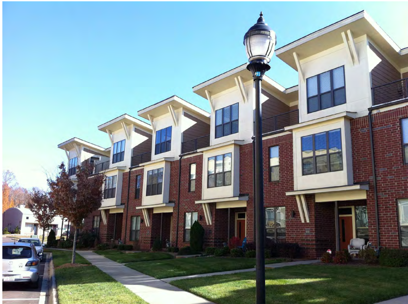
INTERNAL STREET — MAIN VIEW — BUILDING TYPES 'A' & 'B' FRONT NOT TO SCALE