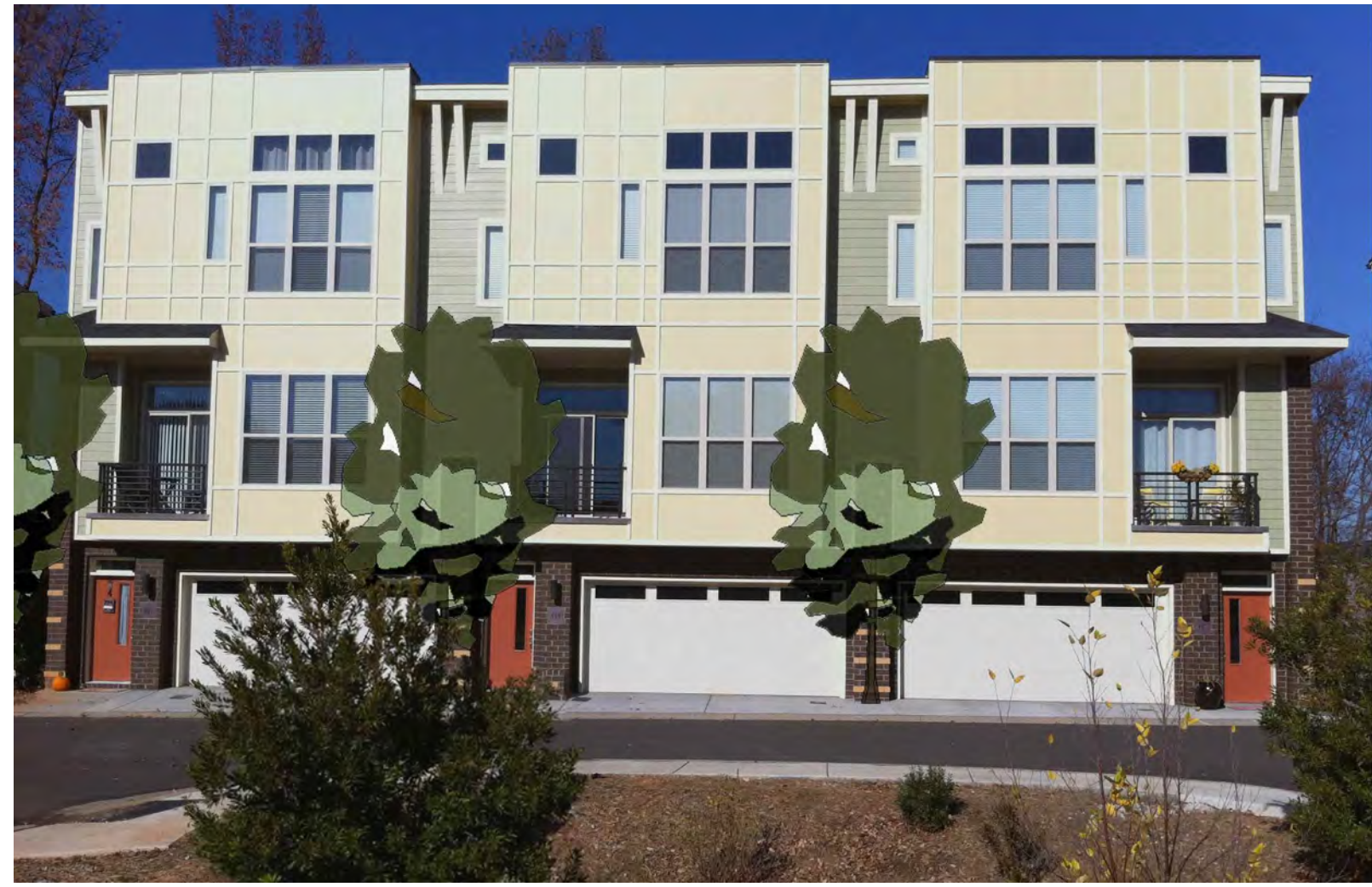
INTERNAL STREET — SECONDARY VIEW — BUILDING TYPE 'C' FRONT NOT TO SCALE