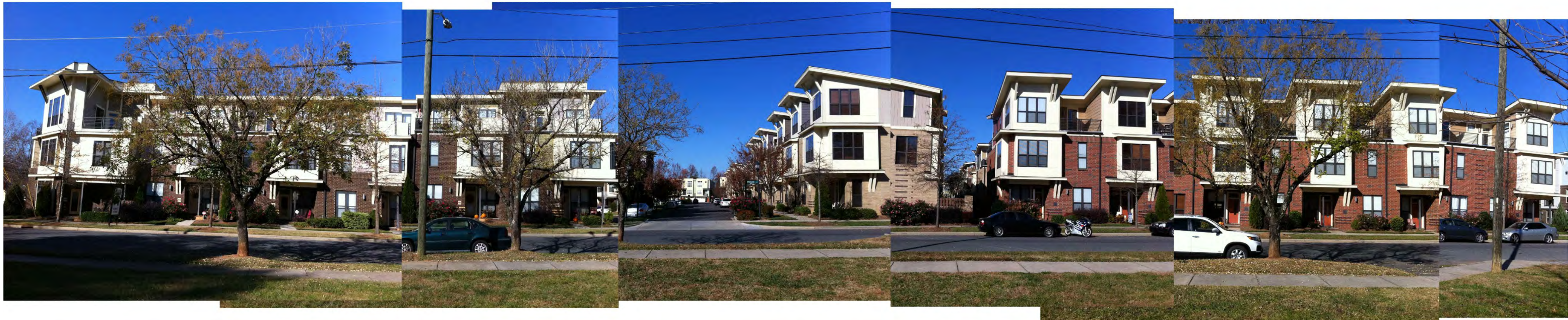
SPENCER STREET ELEVATION — ACADEMY STREET ELEVATION SIMILAR NOT TO SCALE

ELEVATIONS AND VIEWS ARE CONCEPTUAL IN NATURE, THEY MAY BE MODIFIED DURING DESIGN DEVELOPMENT AND CONSTRUCTION DOCUMENT PHASES PER SECTION 62.