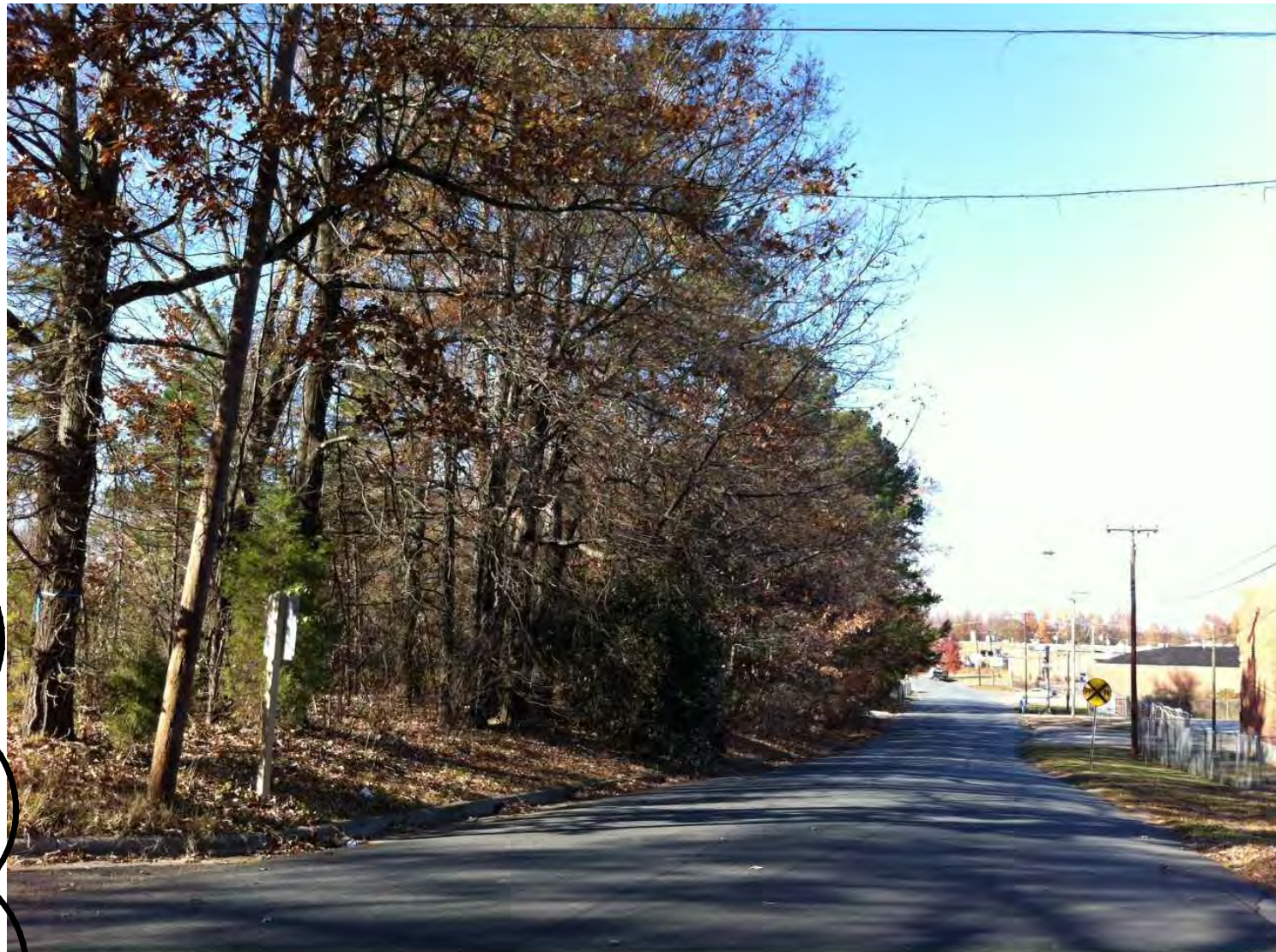
ANDERSON STREET TREE SAVE NOT TO SCALE