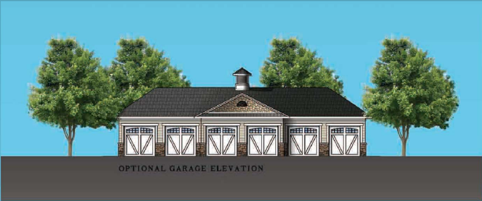
OPTIONAL GARAGE ELEVATION