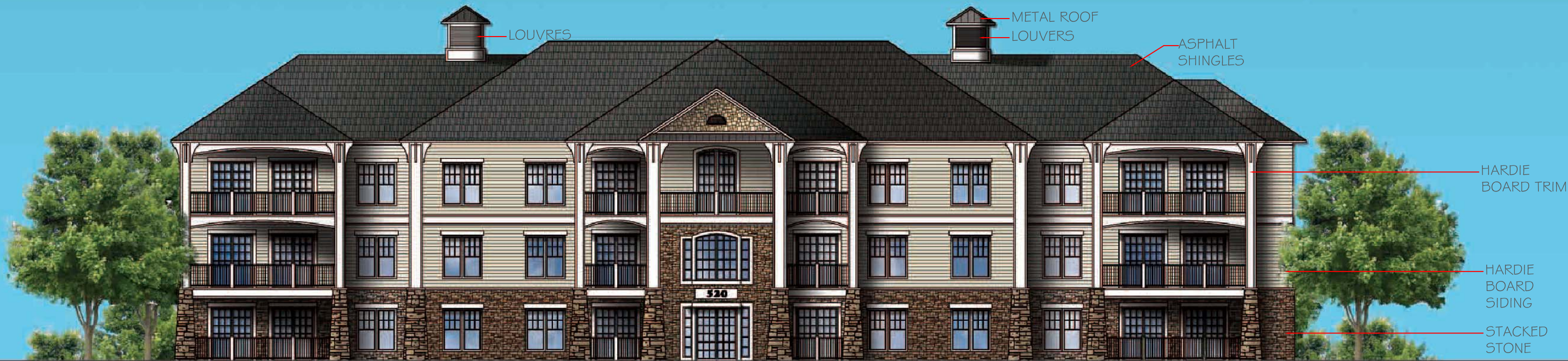
24 UNIT FRONT ELEVATION