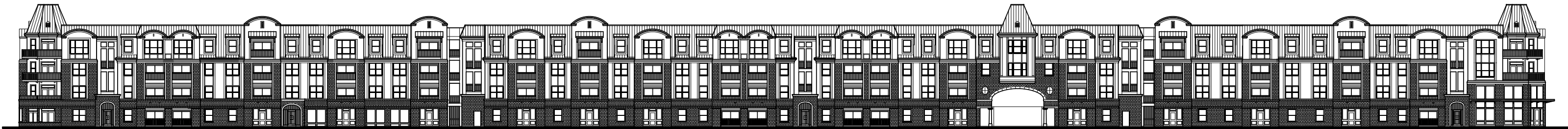
WOODLAWN ROAD ELEVATION WOODLAWN HOUSE, CHARLOTTE, NC.