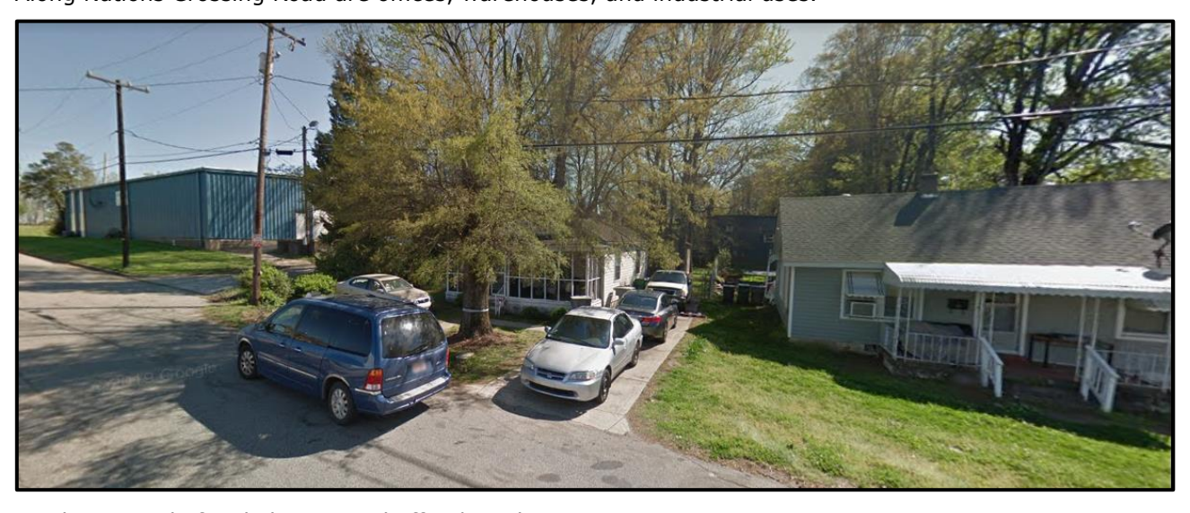
North are single family homes and office/warehouse.