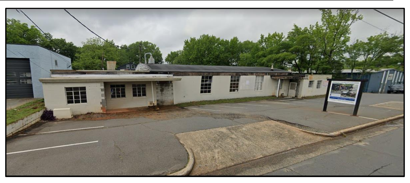
The subject site is developed with industrial/warehouse buildings.