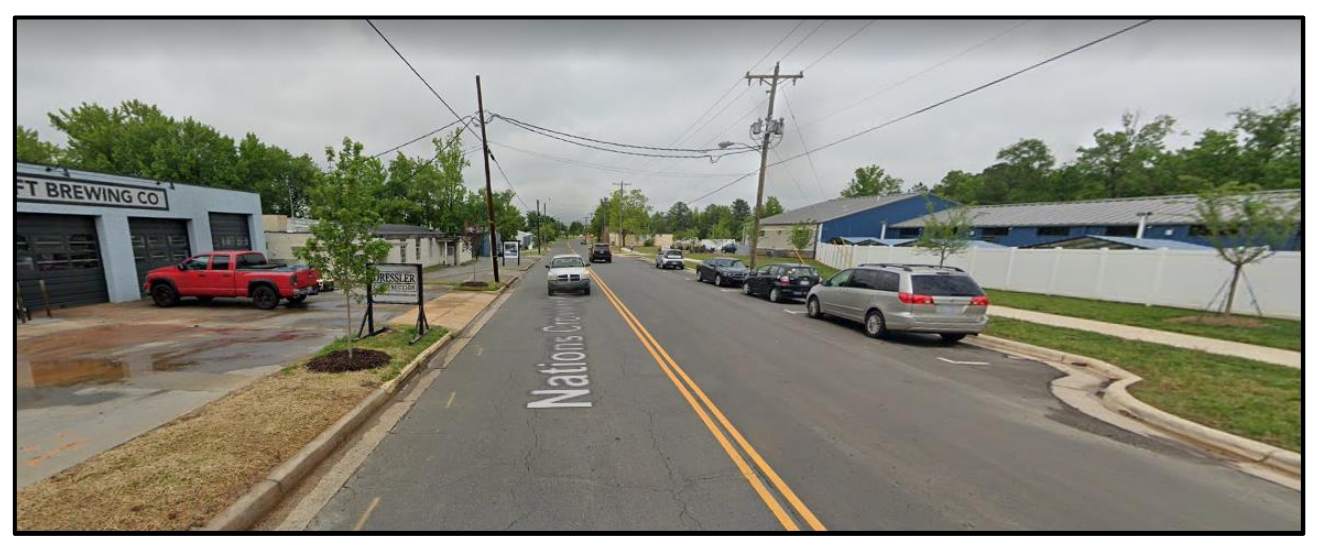
Along Nations Crossing Road are offices, warehouses, and industrial uses.