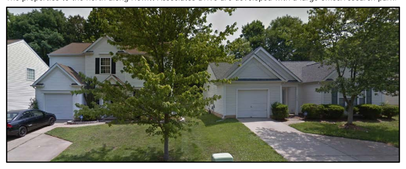
The property to the south along Rumstone lane is developed with single-family homes.