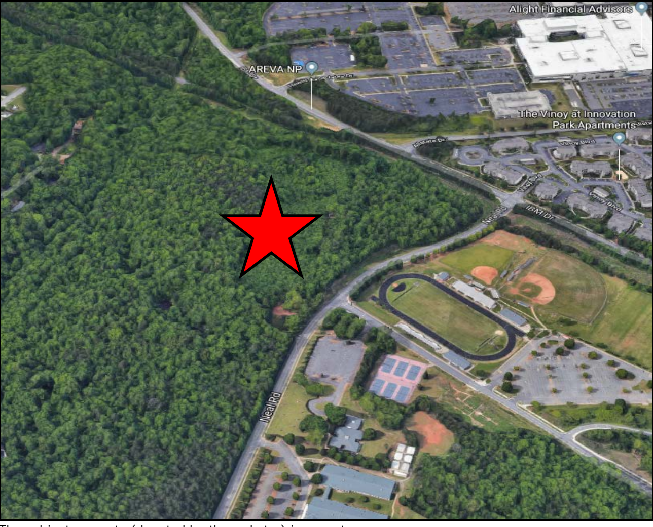
The subject property (denoted by the red star) is vacant.