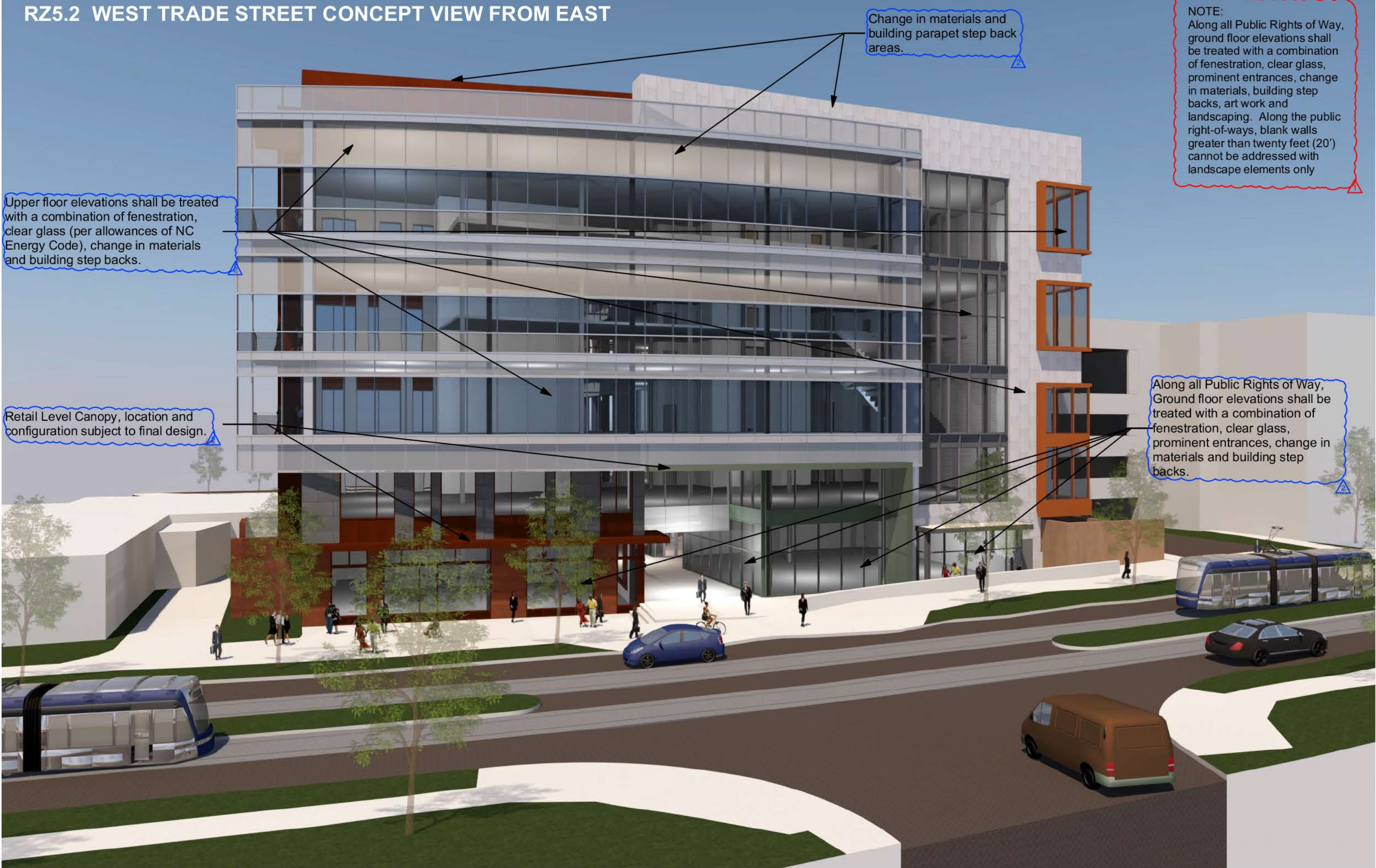
RZ5.2 WEST TRADE STREET CONCEPT VIEW FROM EAST