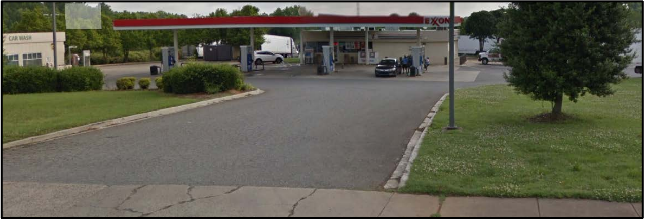
The property to the north across Brookshire Boulevard is a gas station.