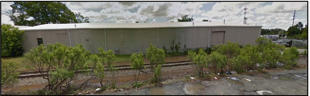
The property to the south along Lawton Road is a warehouse use.