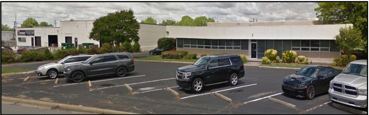
The property to the west along Lawton Road is an office/warehouse use.