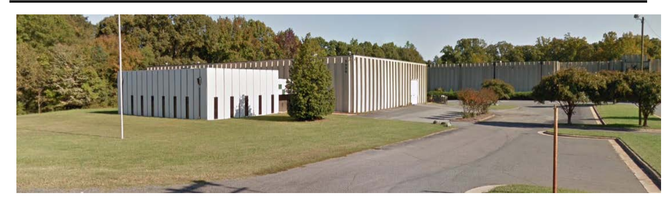
Properties to the east are industrial, and warehouse uses.

Petition 2018-038 (Page 3 of 6) Final Staff Analysis