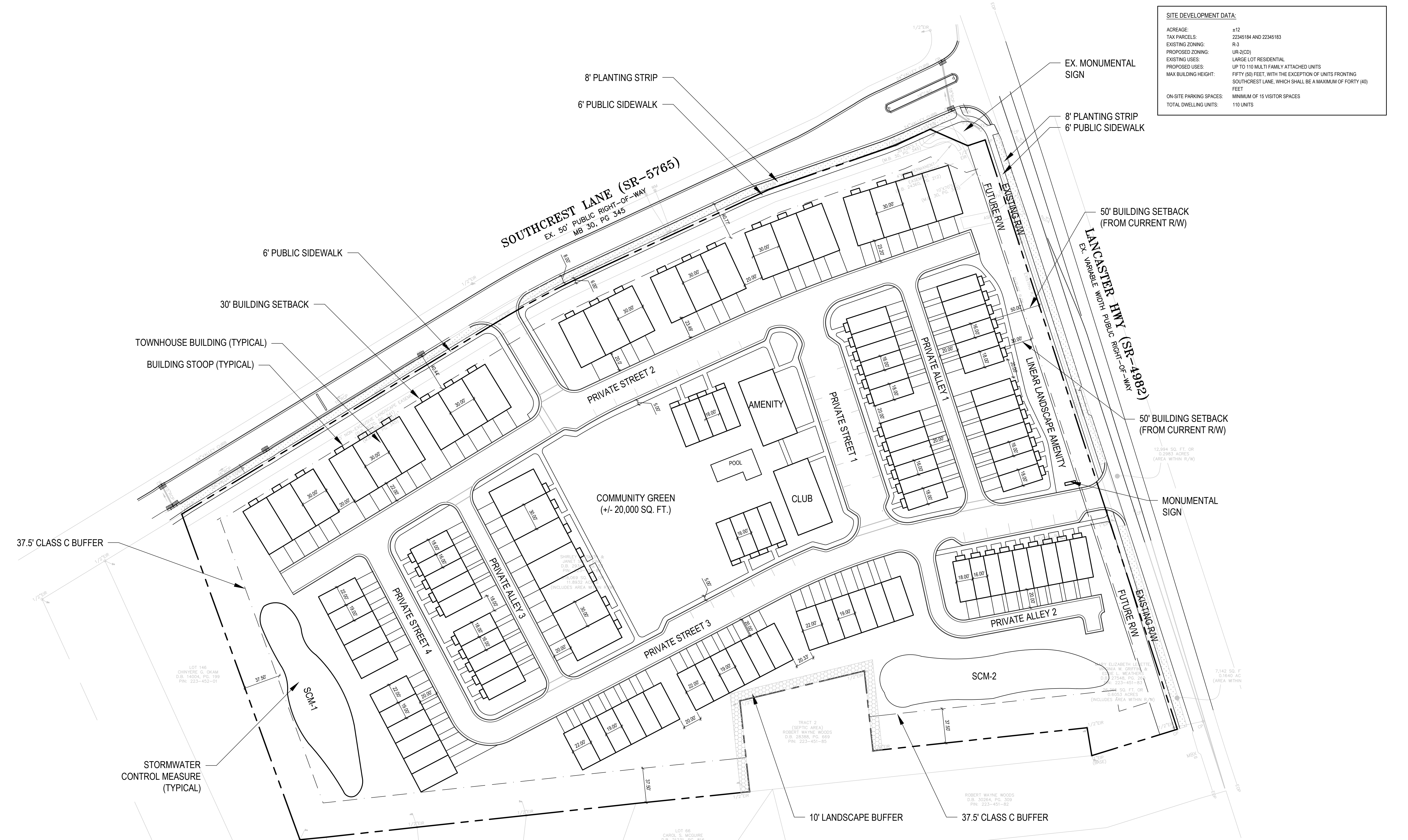
CONCEPTUAL SITE PLAN