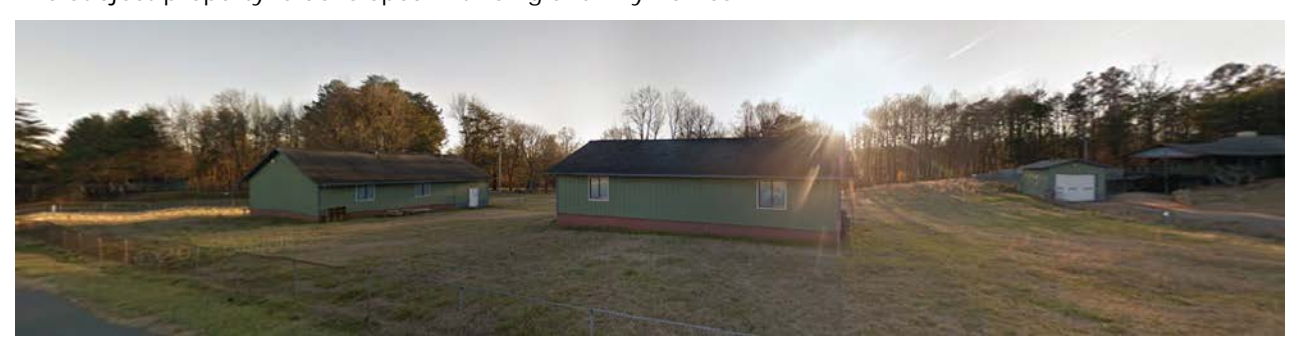
The property to the west is developed with single family homes.