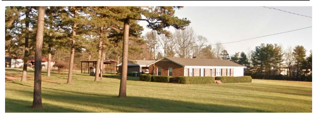
The subject property is developed with single family homes.