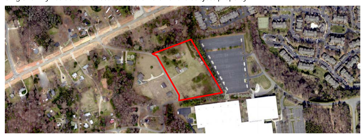
The property to the east of the subject site is a parking facility.