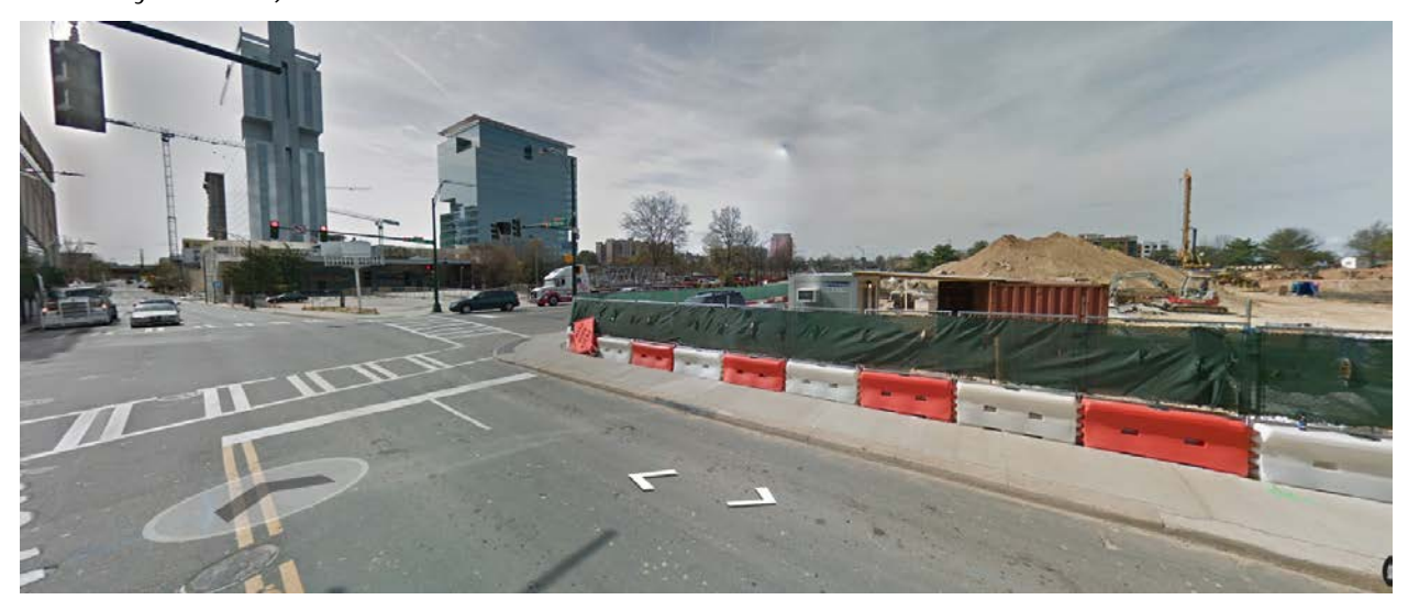
Several sites along Stonewall Street, including the site across South Tryon Street, west of the site are under construction for office, residential and retail developments.