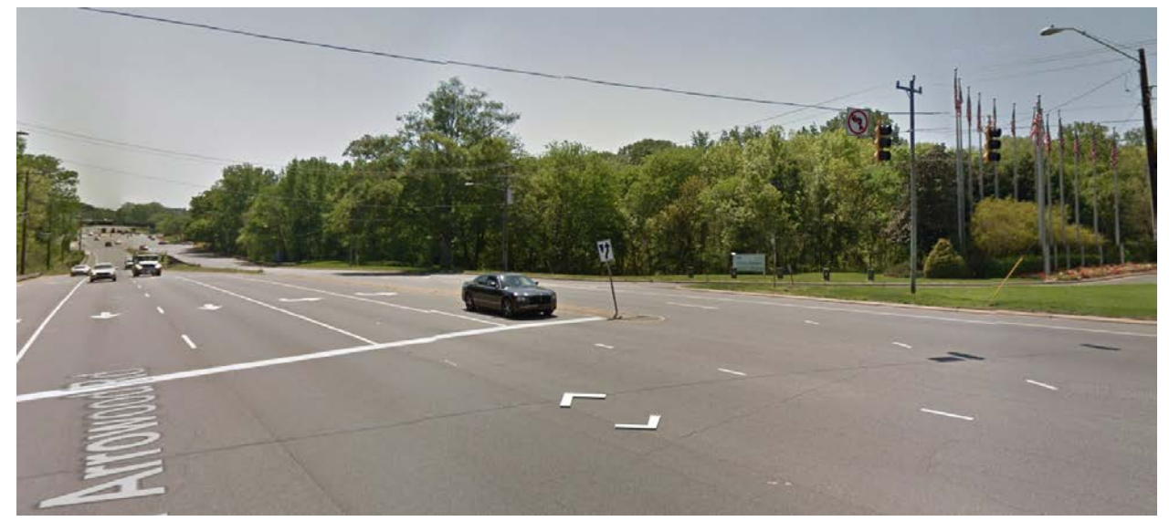
East and west of the site, along West Arrowood Road are vacant, wooded parcels.

West of the subject site, with access from Hanson Road, are several single family homes.