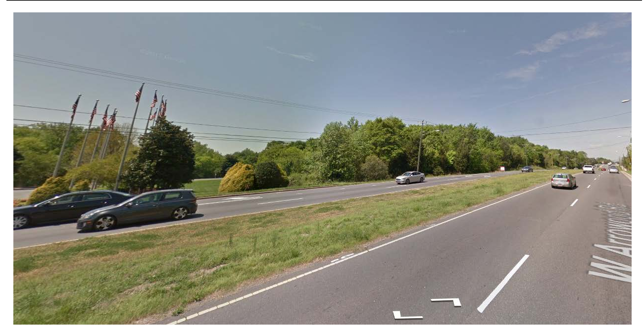
The subject site is wooded and vacant along West Arrowood Road.